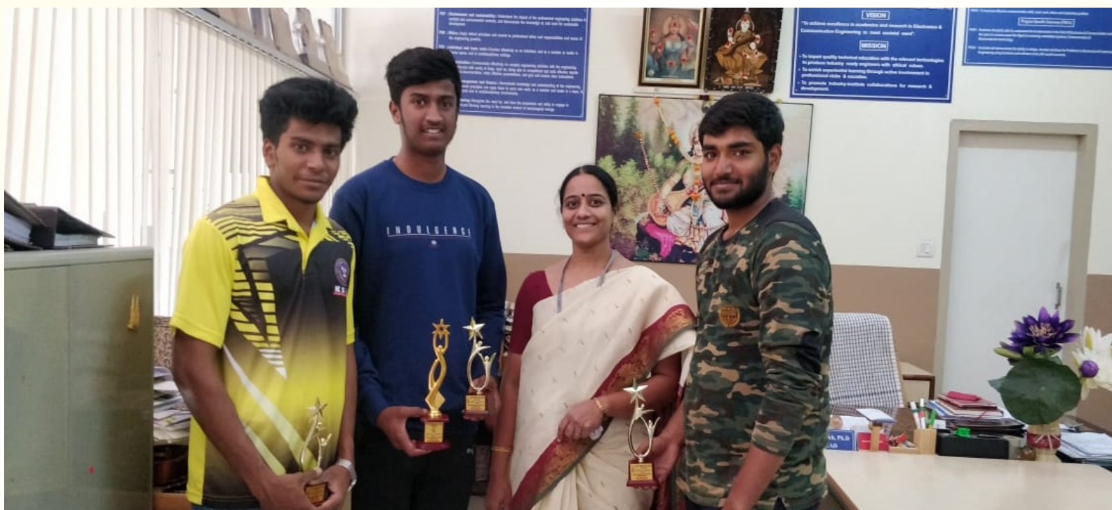
The Department of Electronics and Communication was awarded the Championship during sports day 2019

Most companies look for real world experience when hiring and the best way to get that experience is through internships. Our students have done internships for real life experience and exposure in various companies like Kaaenaat, Imprimed, DARE, Bosch LTD, BSNL, RTTC Mysore, BHEL, RVHM, Schneider electric.