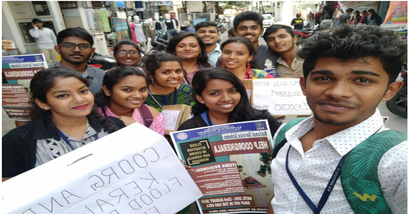
NSS VOLUNTEERES GENERATING FUND FROM PUBLIC