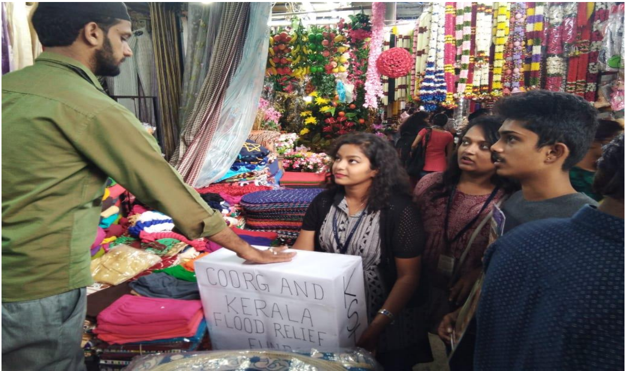
NSS VOLUNTEERES GENERATING FUND FROM PUBLIC