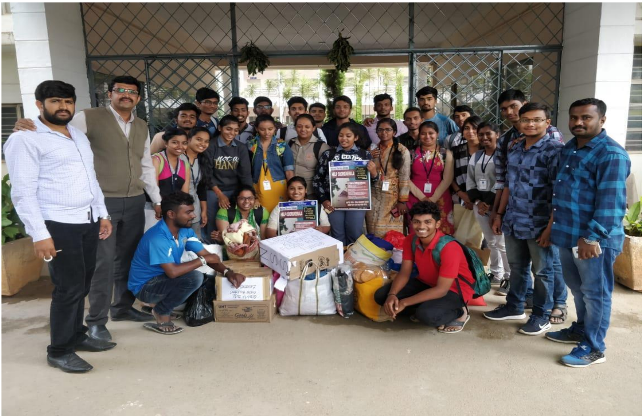
SENDING COLLECTED ITEMS TO KODUGU