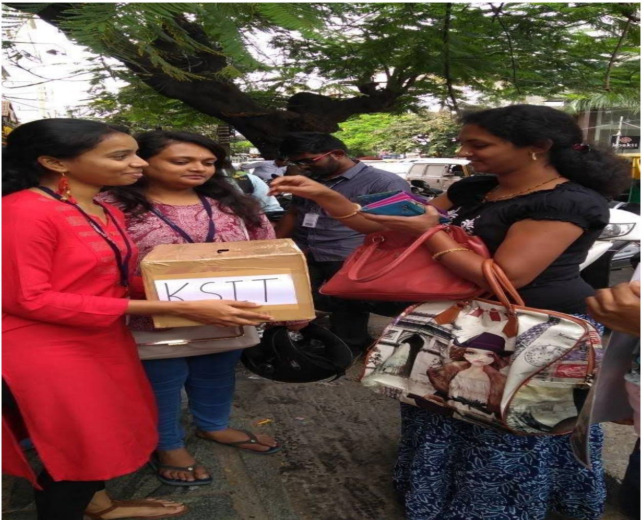
FUND COLLECTION FOR KODUGU AND KERALA FLOOD RELIEF: 25-08-2018