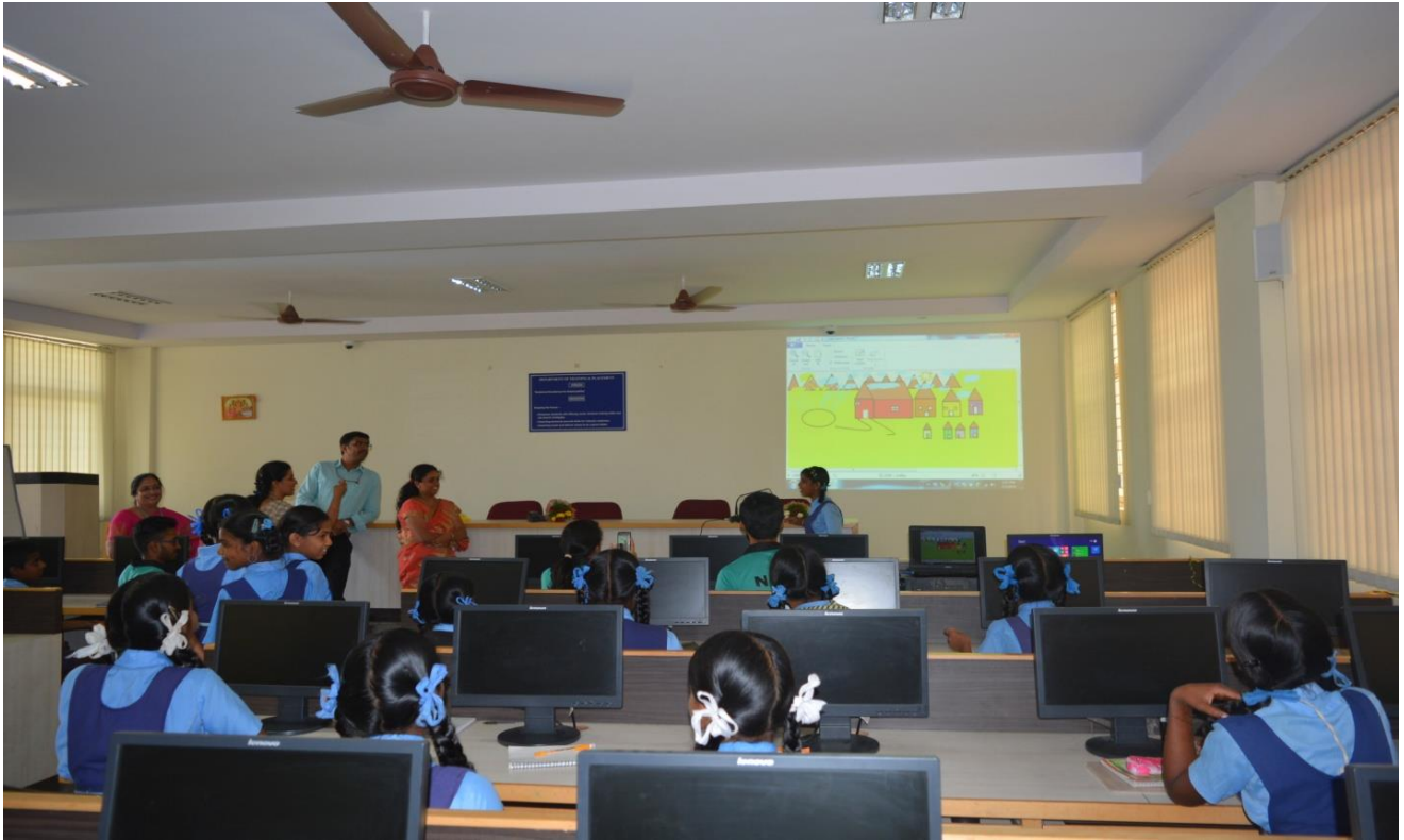
Student sharing his experience about the program