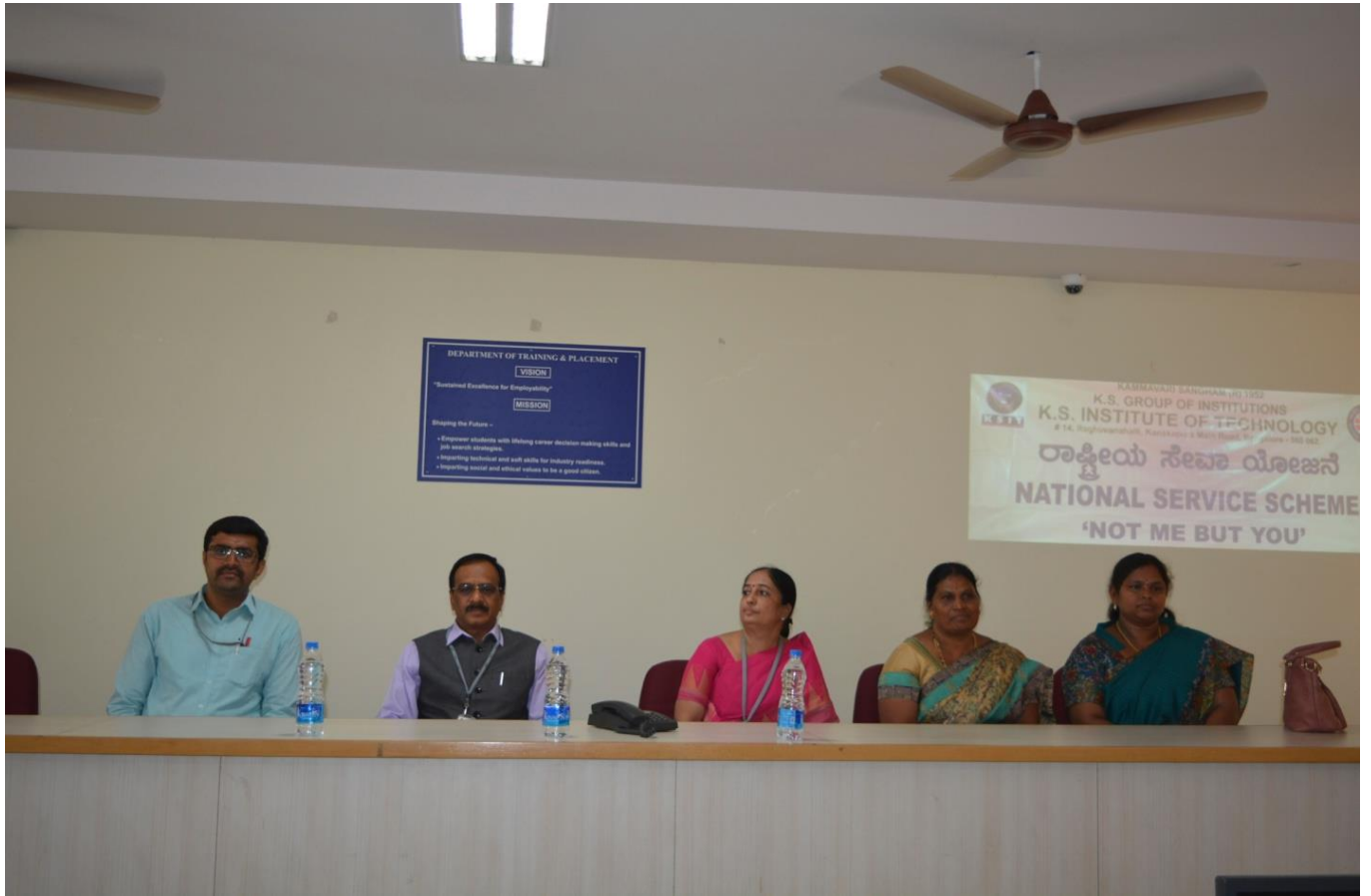
Dignitaries inaugurate the program