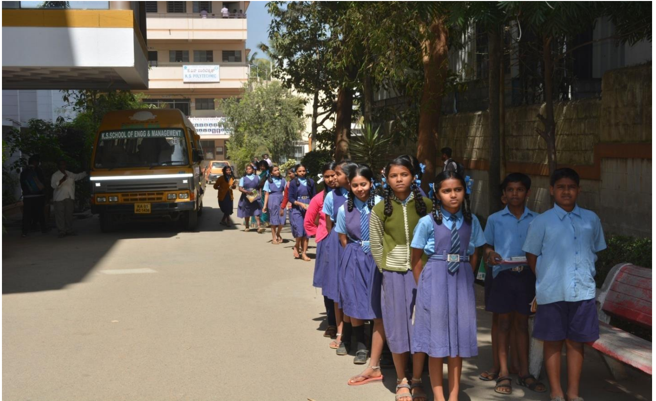
Transportation facility for students