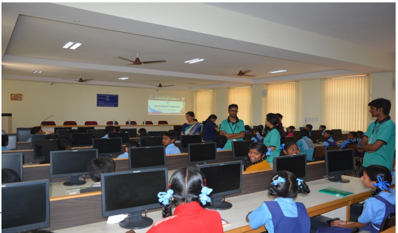
Students at KSIT campus