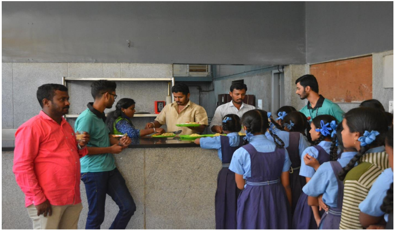
Students having lunch in the canteen