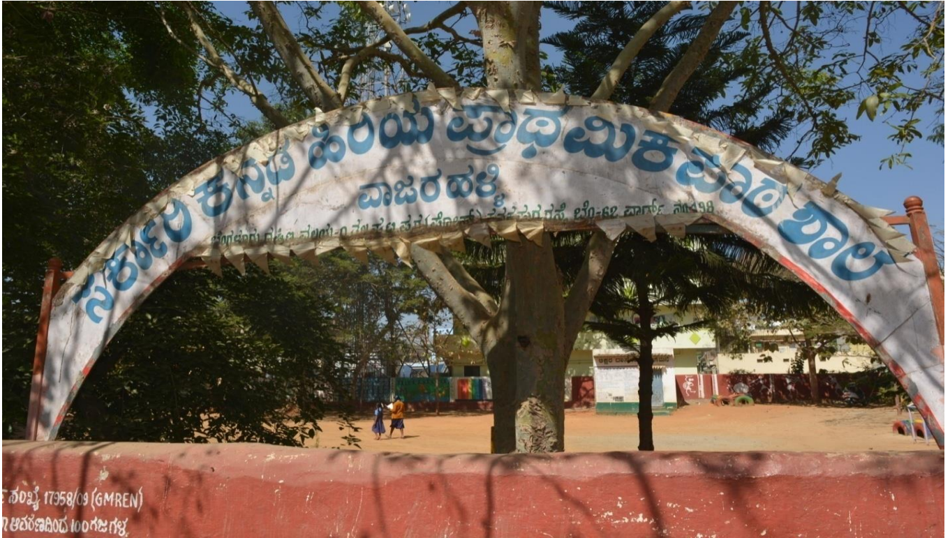
Govt school ,Vajarahalli