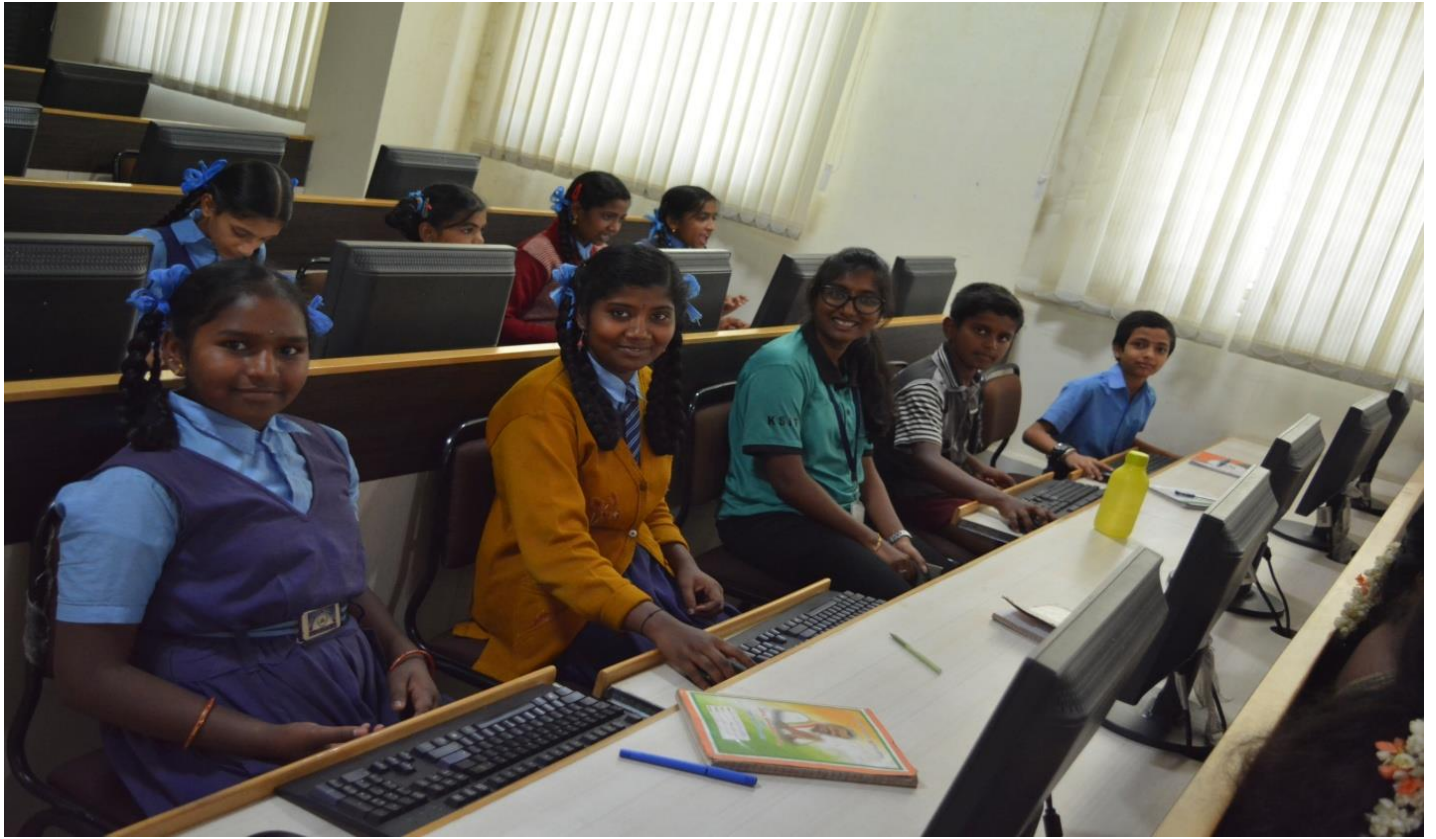
NSS volunteers teaching the students