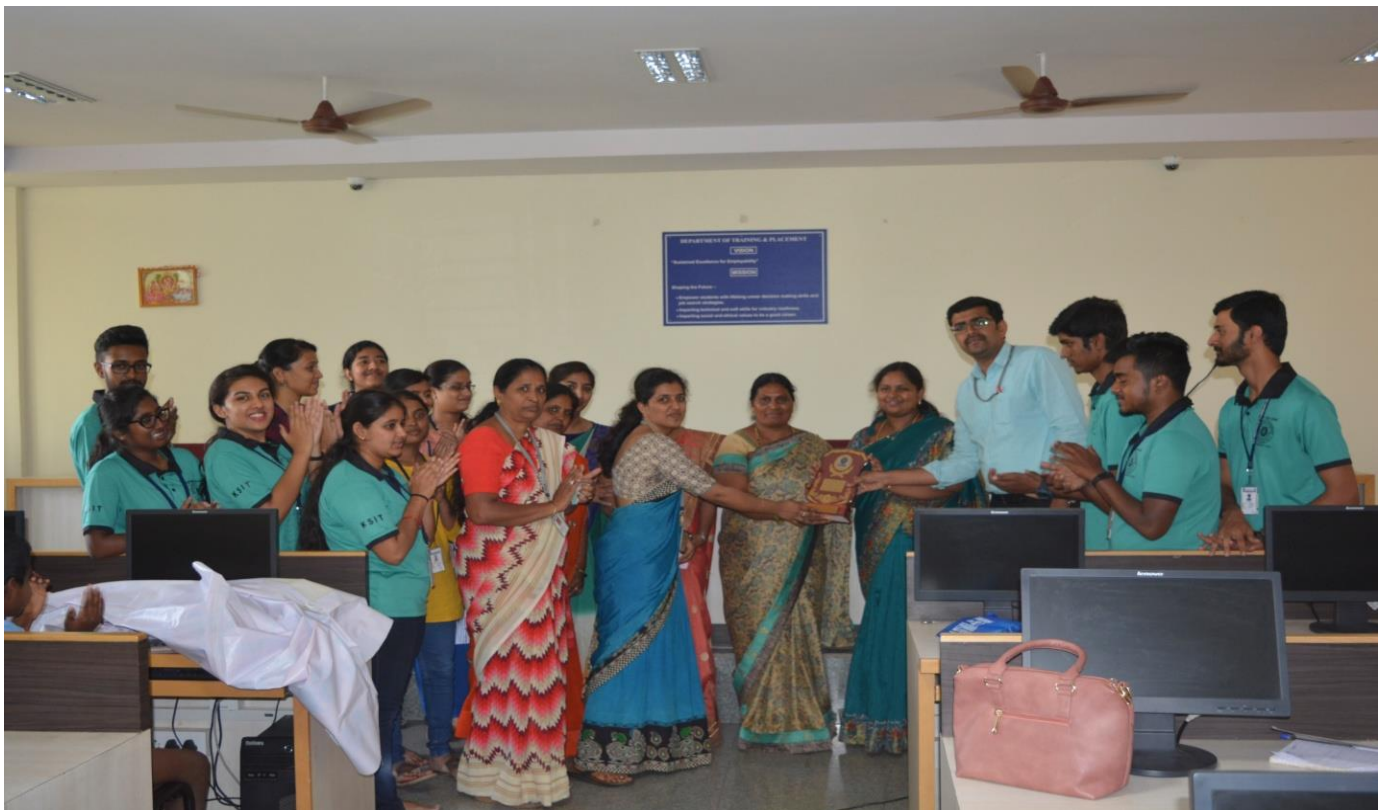
Felicitating Govt. school teachers