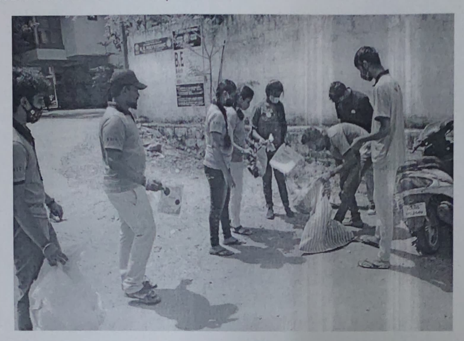
Elimination of single use plastic at KSIT campus by NSS Volunteers

An initiative is been taken to keep our college campus free of plastic and replace them with eco-friendly alternatives.