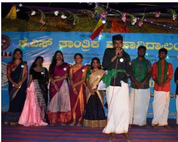
Cultural performance by team Kuvempu