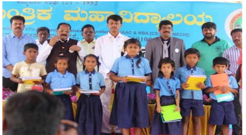
Distribution of books for school children and slates for Anganwadi kids