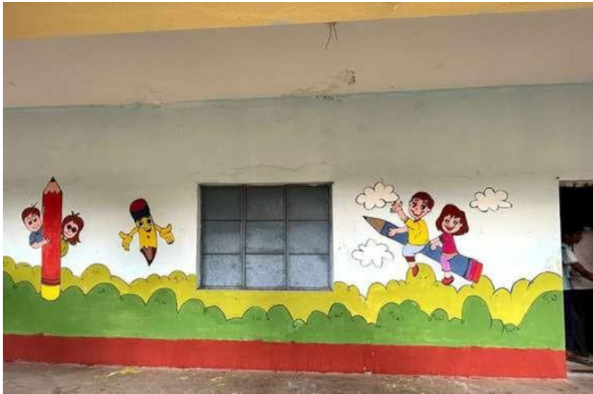
Wall Painting done by NSS volunteers