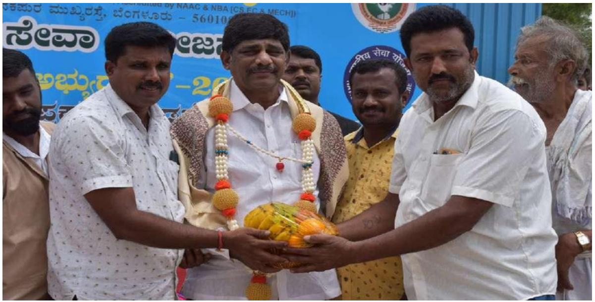
Honorable MP DK Suresh