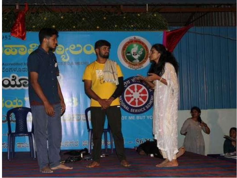
Awareness Skit by NSS volunteers