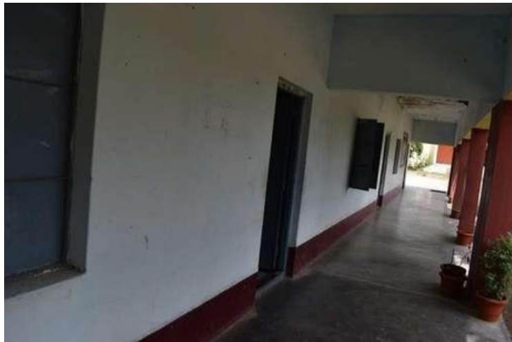
Before Wall Painting