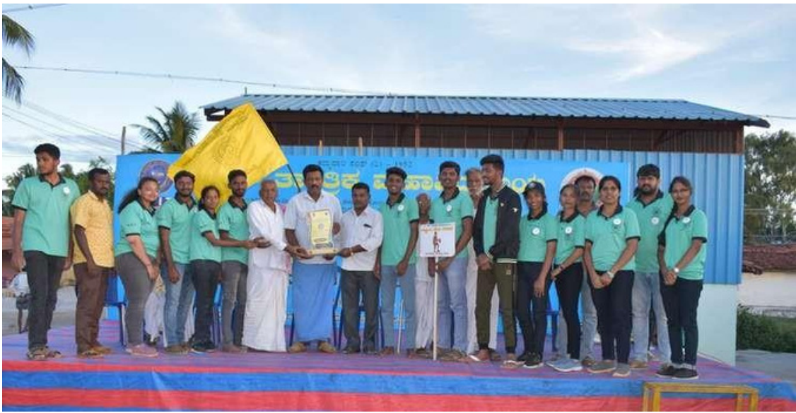
Team Sangolli Rayanna