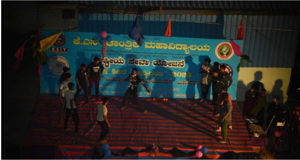
Plastic Awareness Skit by NSS volunteers