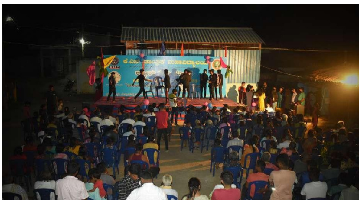
Mime by NSS volunteers