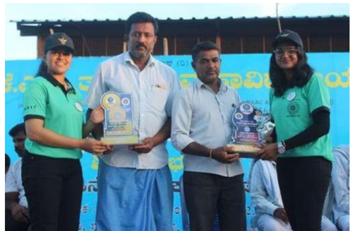
Individual award's distribution for NSS volunteers