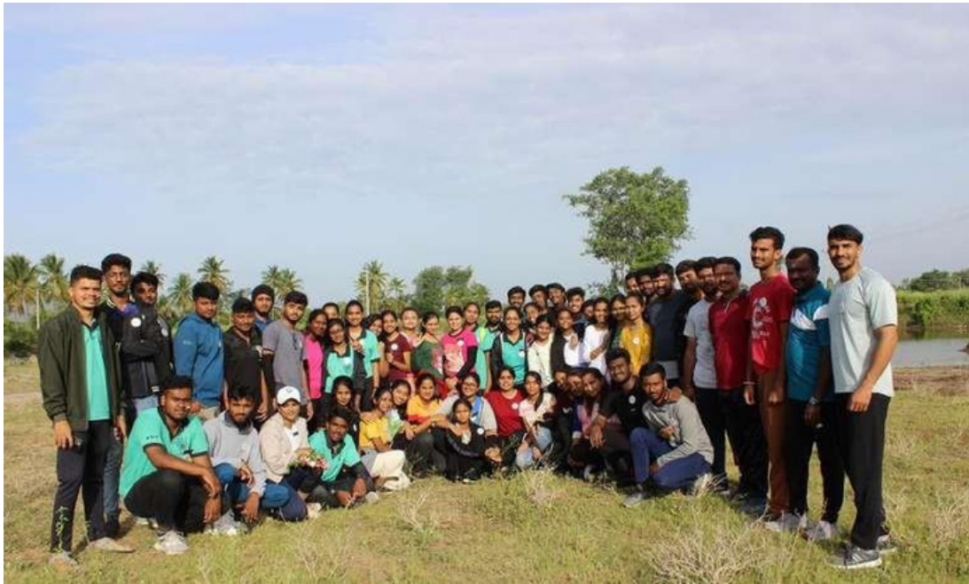
Group photo at Morning walk