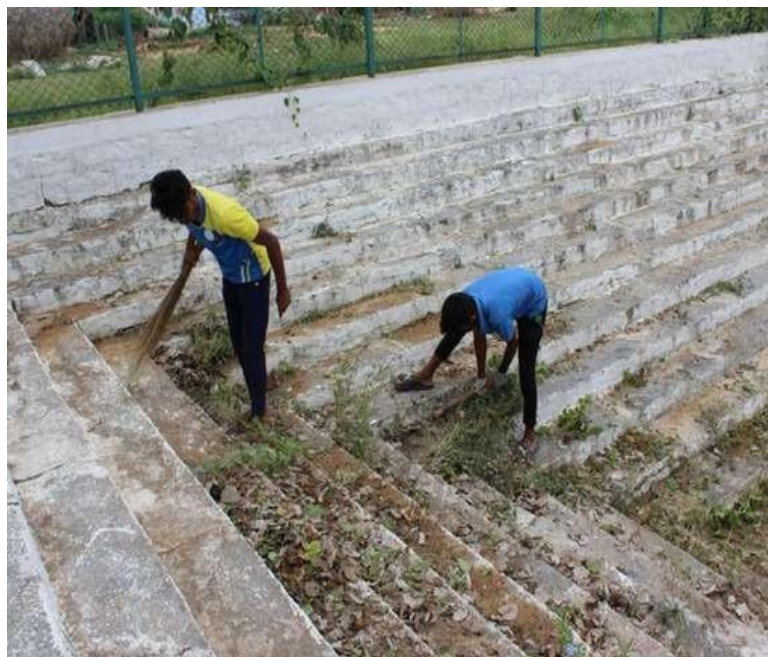
Shramadhana by team KITTUR RANI CHENNAMMA