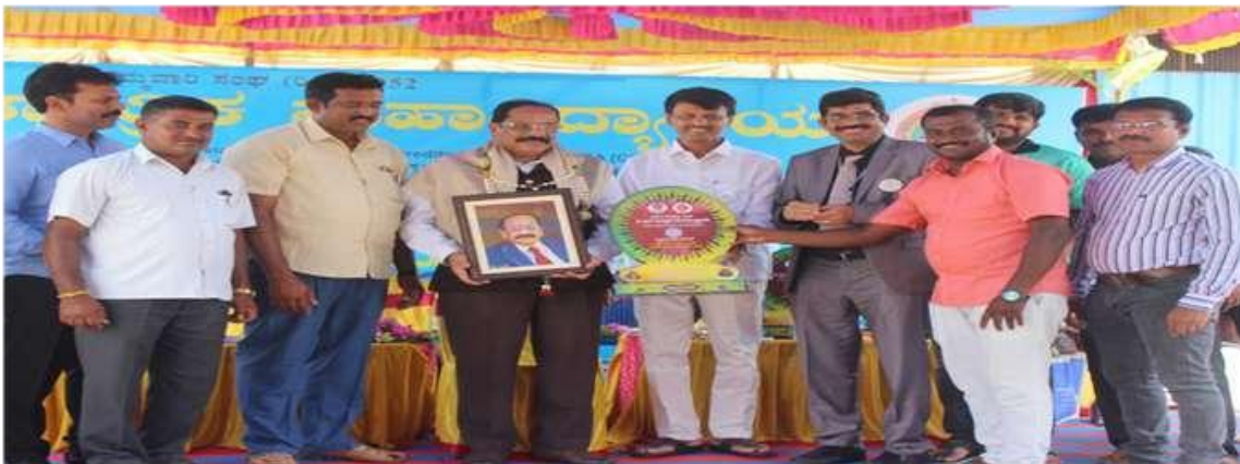
Honoring President of KSGI