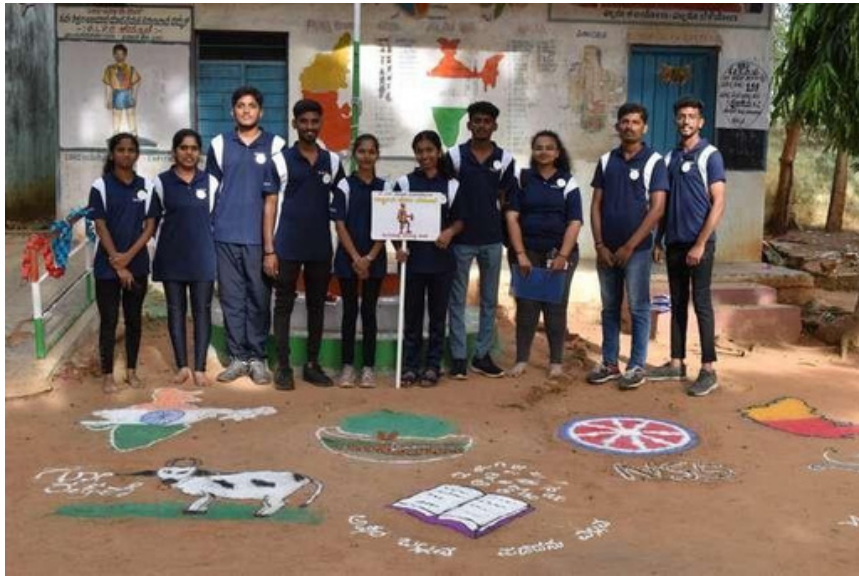
Flag hoisting by team Sangolli Rayanna