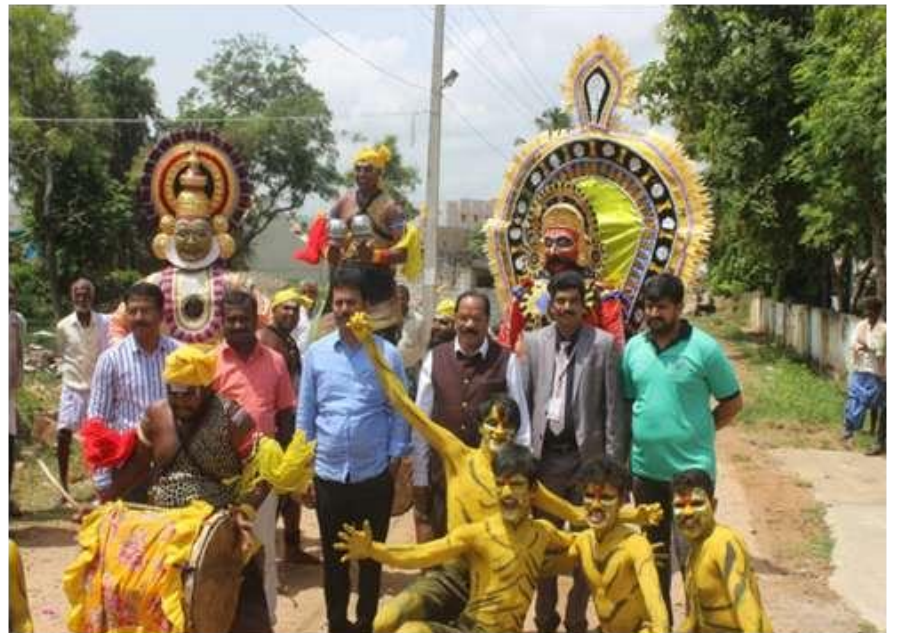
Guests entering the Inaugural function