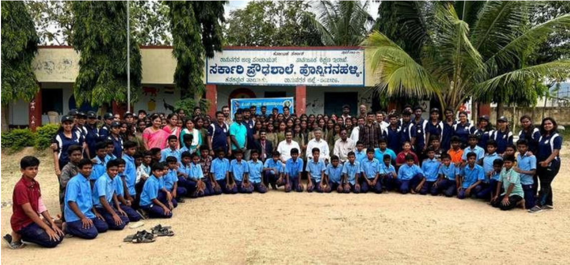
College Management and NSS Volunteers at Honaganahalli Govt High School