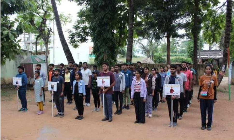
NSS volunteers gathered for flag hoisting

And with all good efforts the cultural program got ended with good messages. Later we all had our food and assembled near samudhaya bhavana for next day planes.