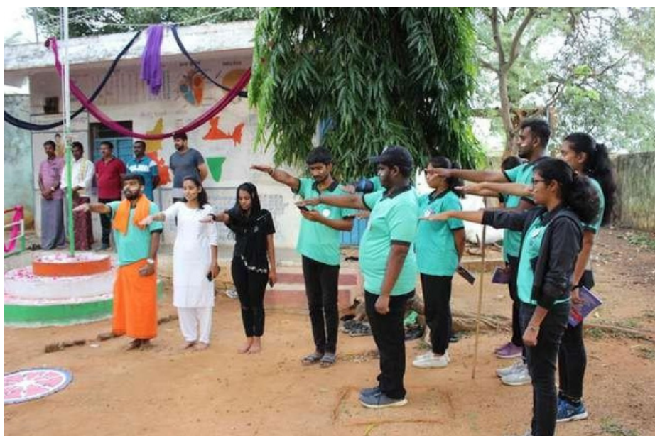
Flag Hoisting conducted by team KUVEMPU

And then later members of team Vivekananda had quick interactions with villagers about the events conducted and took feedback about the Shramadhana of the day. And after all the entertaining factors at the end there was a Theme based drama which holds a good message for both villagers and our volunteers about the protecting Environment keeping the in mind as "Environmental protection doesn't happen in a vacuum; we can't separate the impact on the environment from the impact on our families and communities". At the end of the program people were informed about next day's dental camp and said about the importance of having good dental health and they were asked to visit Samudhaya Bhavana where the camp will be held. And food Committee served the dinner, and they handled their department with atmost concern and cleanliness. By this our activities for the day was winded and having the discussion about plans for the next day and then we all returned to our allotted stay place and we slept around 11.00 p.m.