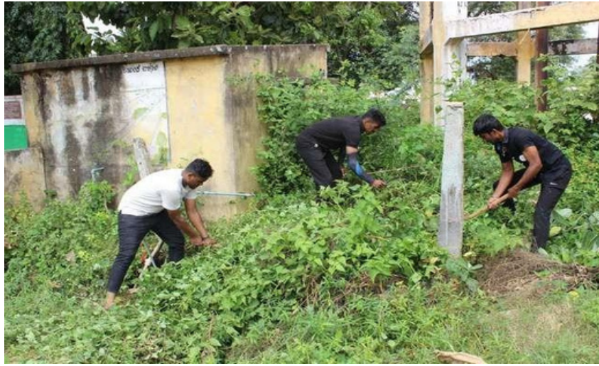
Shramadhana by team KUVEMPU