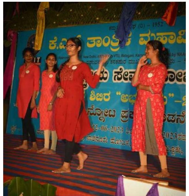
Cultural activities by NSS volunteers