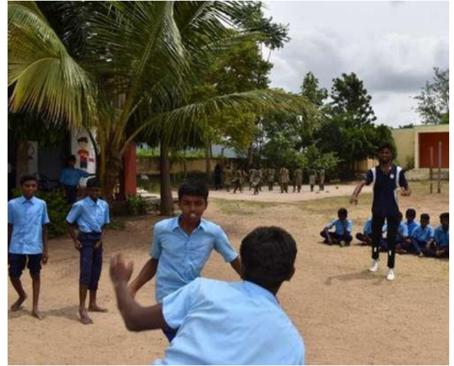
Students participating in sports at Honaganahalli Govt High School