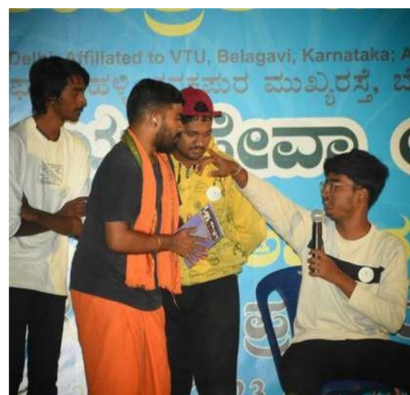
Skit by NSS volunteers