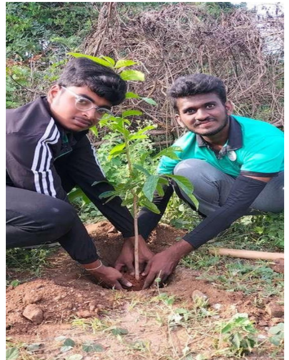
Planting saplings at Honaganahalli village