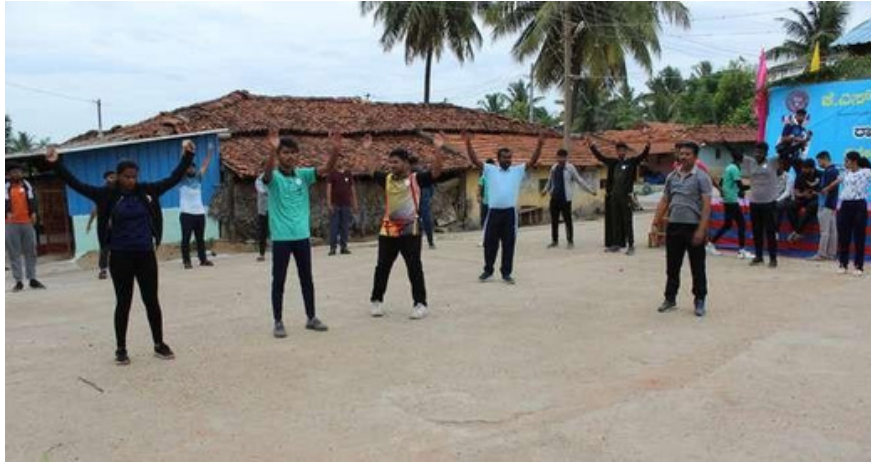
Aerobics for fitness