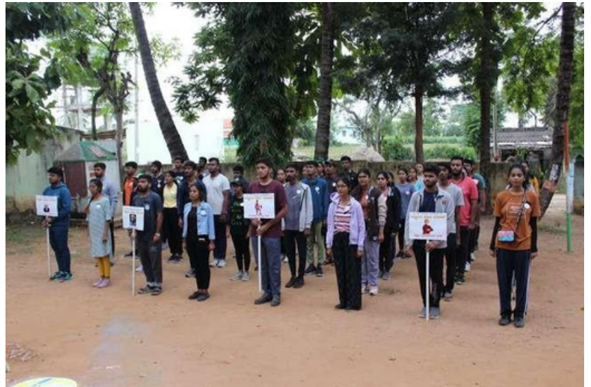
Flag hoisting by our guest NSS volunteers assembled for flag hoisting