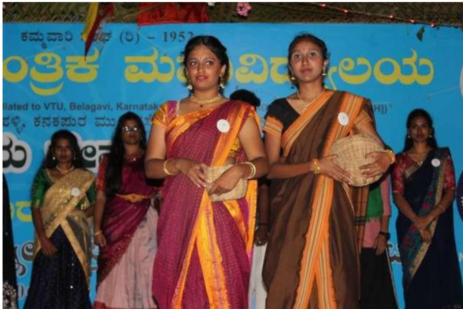
Fashion Walk by NSS volunteers