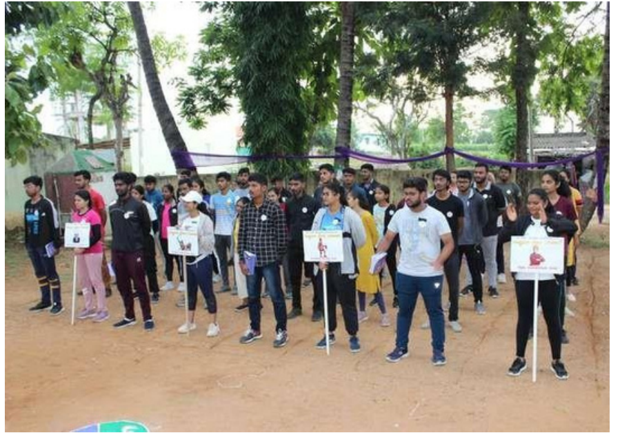
NSS volunteers assembled for flag hoisting