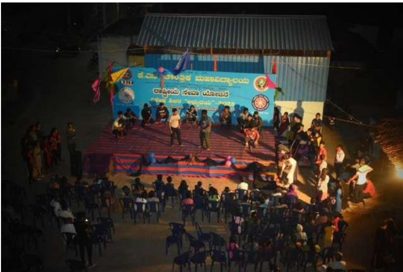
Awareness skit by NSS volunteers