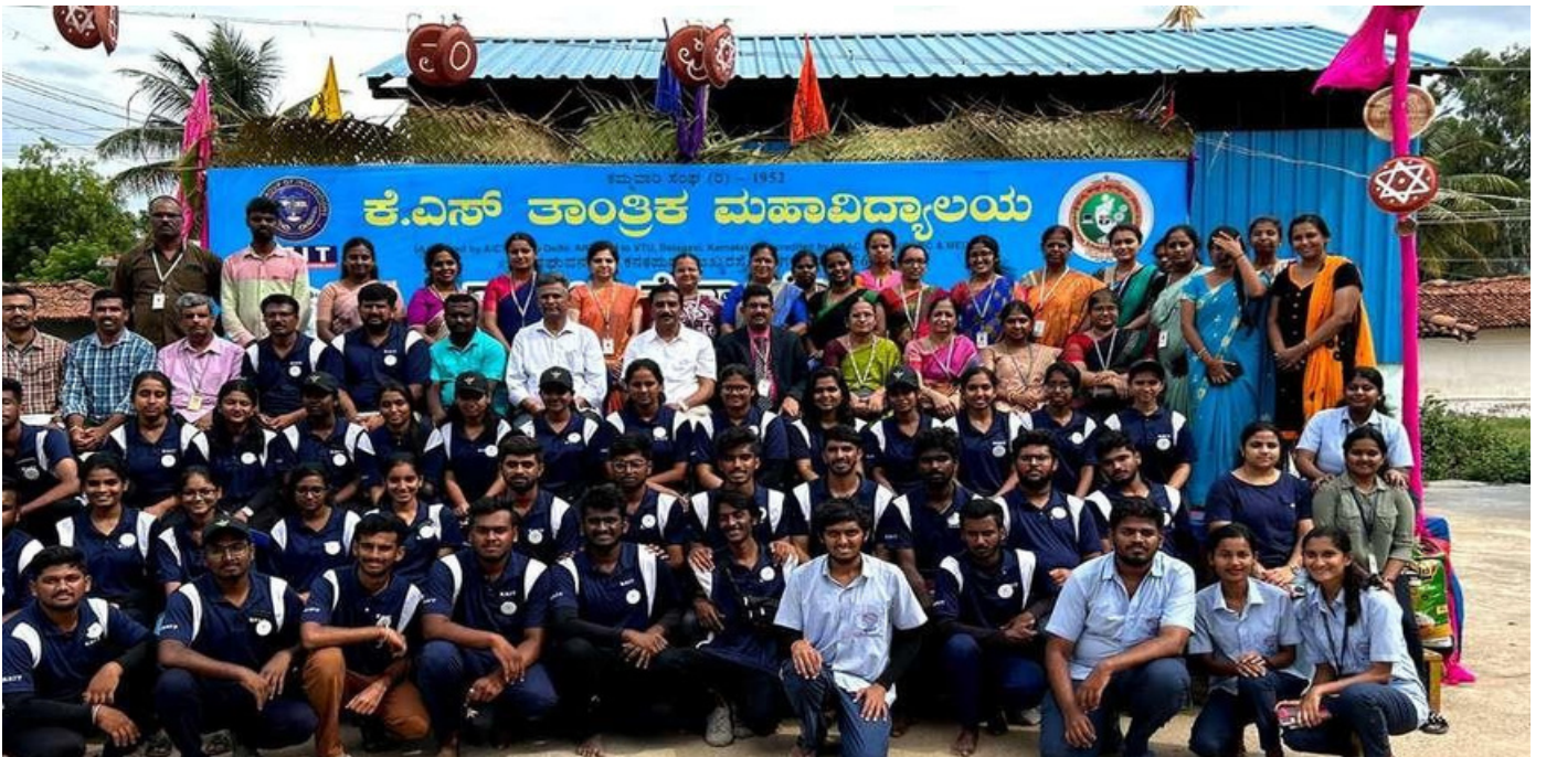
Group Photo with college staff members