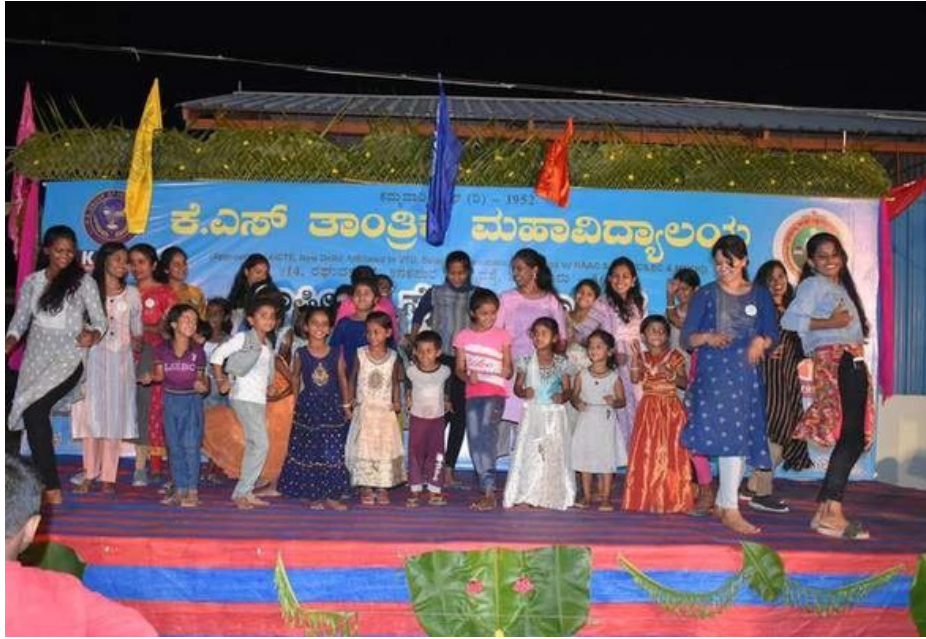
Dance performance by Village Children