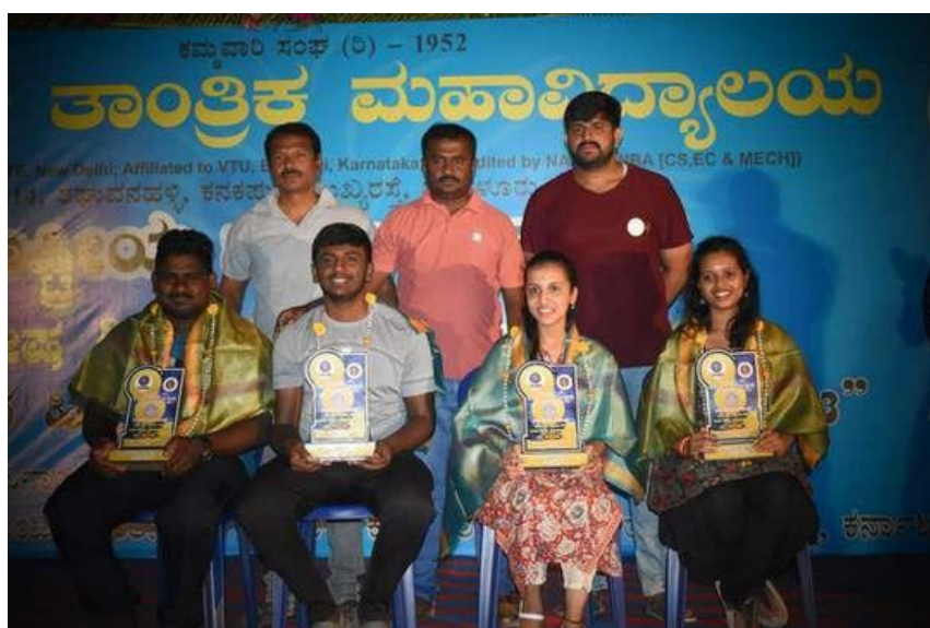
Honoring Alumni's of KSIT