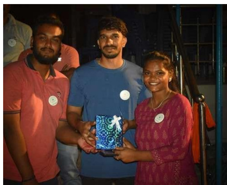
Felicitating team mentors