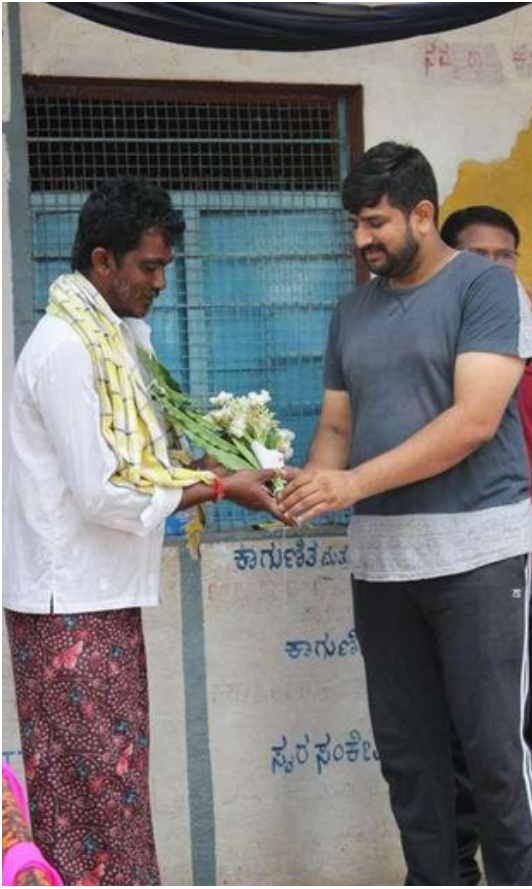
Welcoming Chief guest for flag hoisting