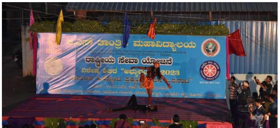
Stage performance by Gurudeep (Camp Captain)