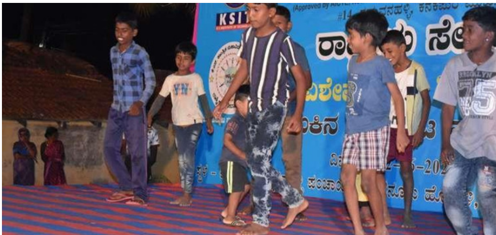
Stage performance by village children