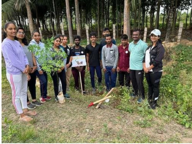
Team Kitturu Rani Chenamma