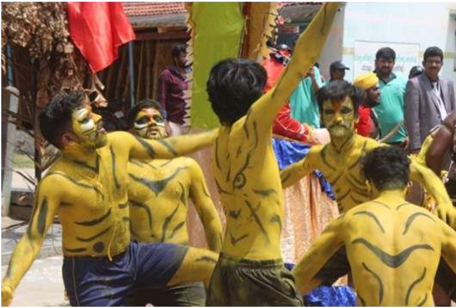
Huli Kunitha by NSS Volunteers