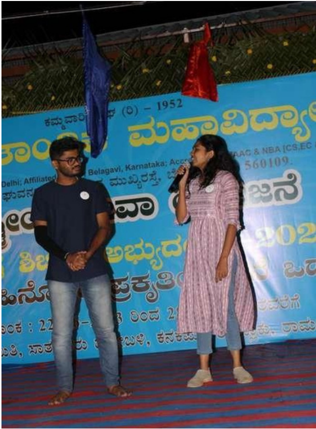
Cultural's By team Vivekananda