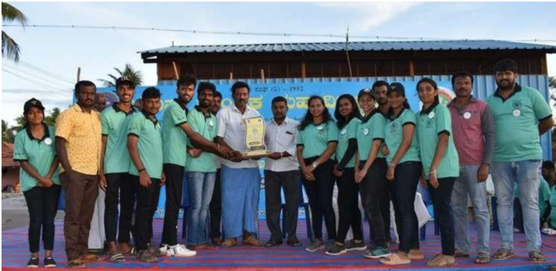
Team Kitturu Rani Chenamma