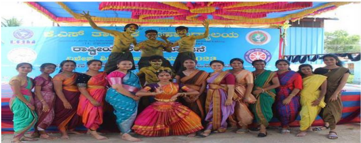
Cultural performance by NSS volunteers