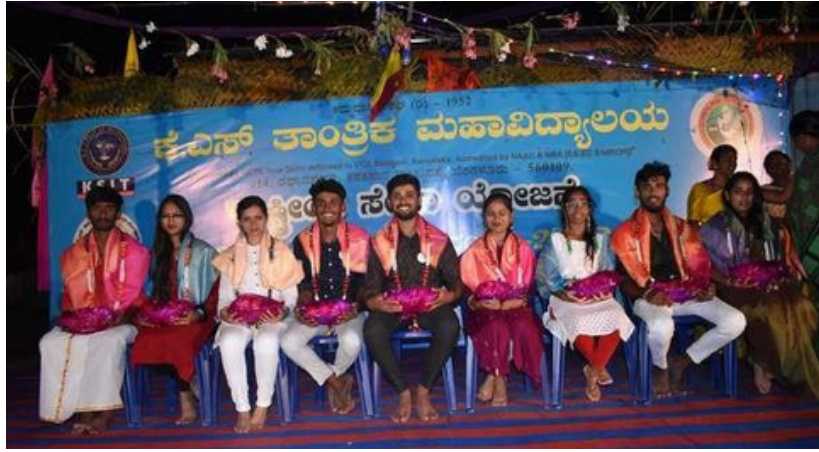
Felicitation for NSS volunteers by Villagers