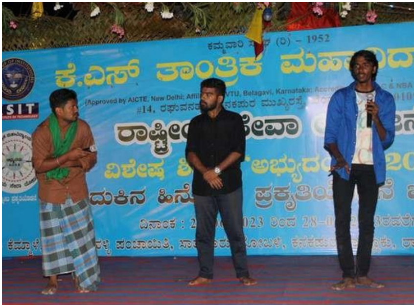
Cultural performance by NSS volunteers