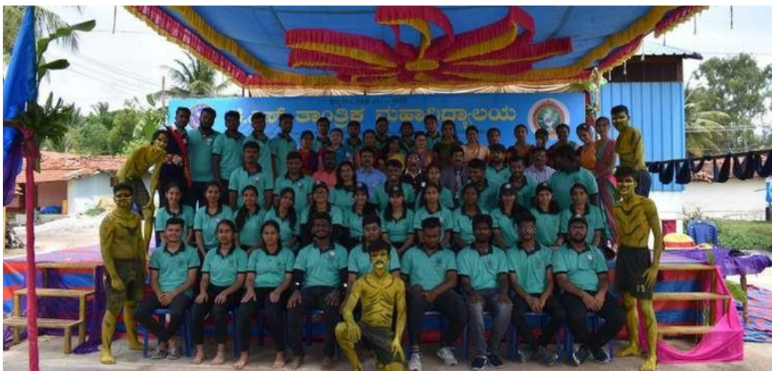
Group photo of NSS volunteers along with the Guests