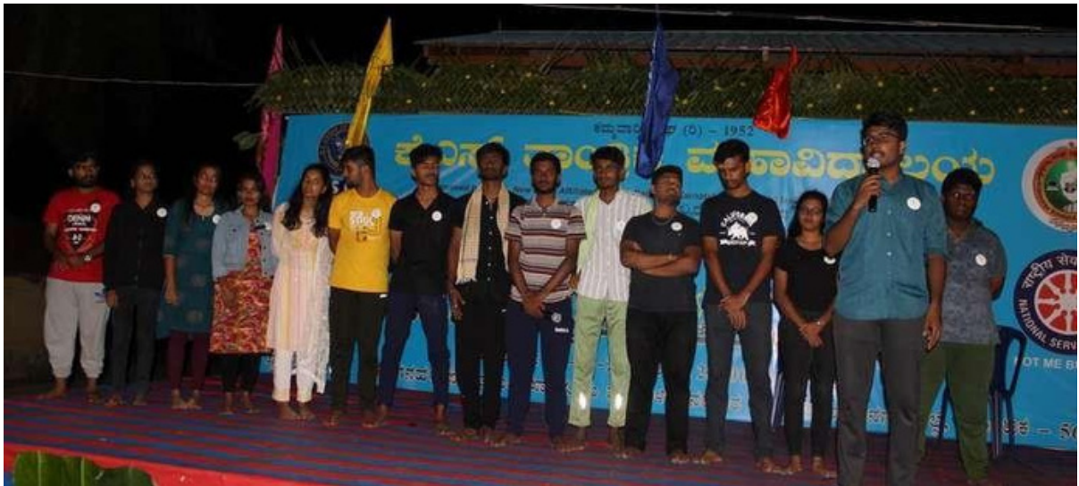
Farmers oriented skit by NSS Volunteers