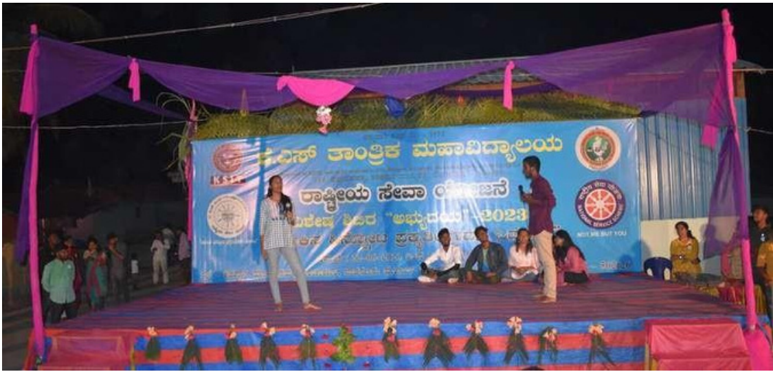
Comedy skit by team Kitturu rani chenamma