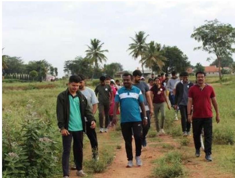
Morning walk to the nearby lake