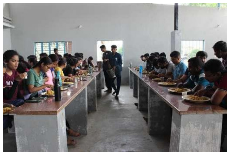
NSS Volunteers having their lunch