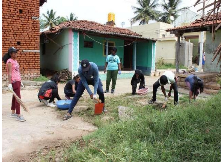
Shramadana by NSS volunteer