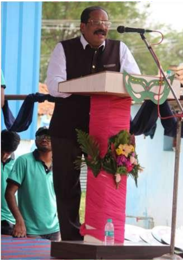
President of KSGI addressing the gathering