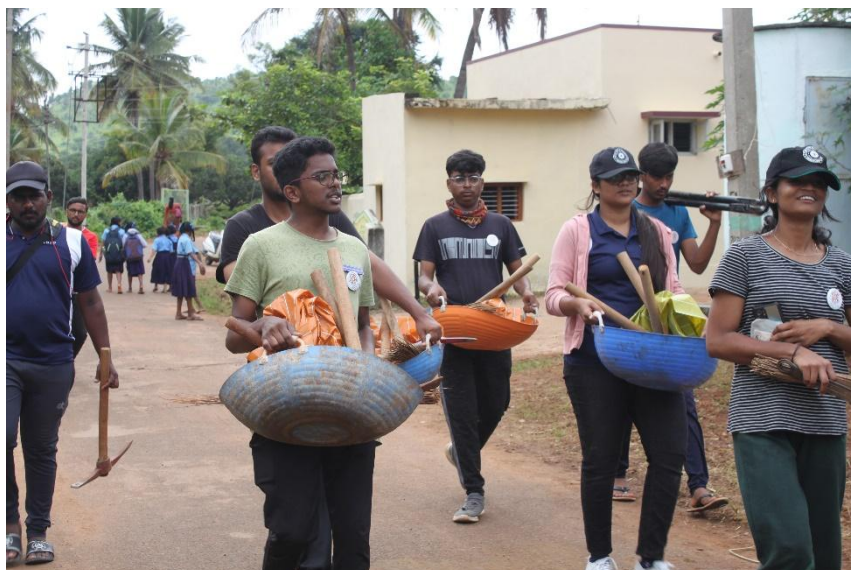
Preparing for Shramadhana