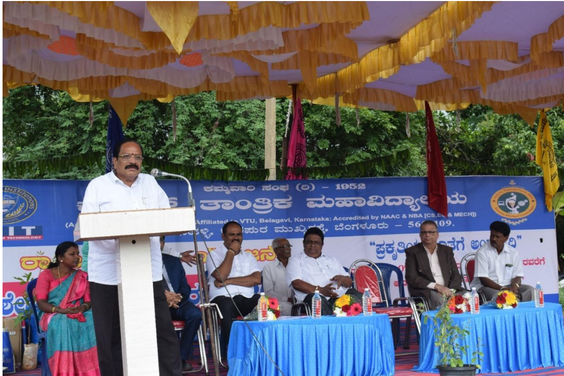
President of KSGI addressing the gathering