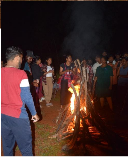
Photos of Campfire