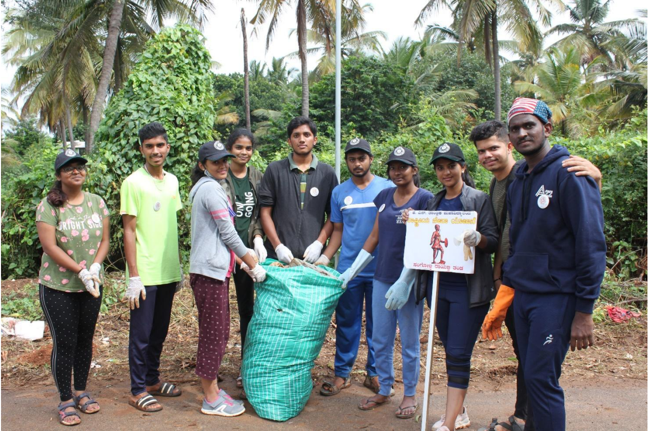
Group photo of team SangolliRayanna