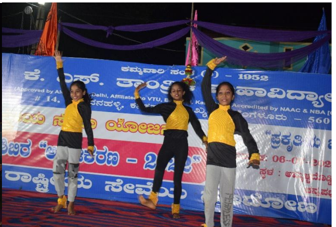
Cultural programs by ABCD dance academy