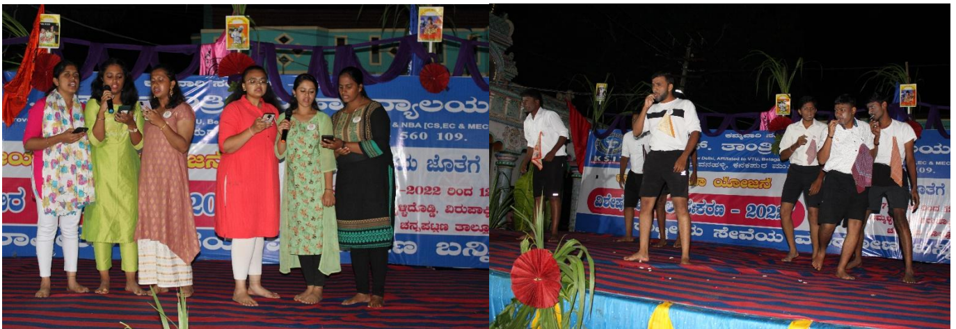
Cultural performances by NSS volunteers