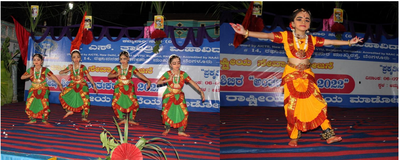
Dance performances by Pushkara performing arts