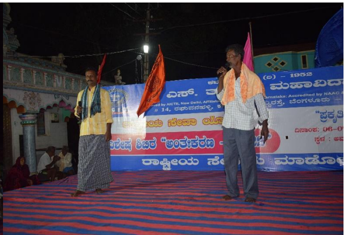
Cultural performances by Villagers