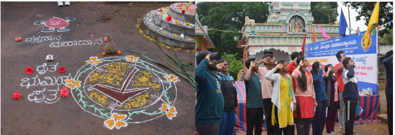
Preparations of flag hoisting

All the NSS volunteers assembled at 5:40am near the flag pole. On this day captains and vicecaptains were not changed and the team responsibilities weren't changed. Chief guests for flag hoisting were Shivanna, Appaji, Sujan(Alumini of KSIT). We all sung NSS song and had the pledge. The theme for flaghoisting was about blood donation as we had blood donation camp on that day. Later we all went to Virupakshipura to distribute pamphlets about health camp that is conducted at Government School the next day. We had our breakfast and later blood camp was conducted. Books were distributed to the students of Government school by the Aluminis of KSIT. DKSuresh, honorable MP of Bangalore Rural arrived as the chief guest for the day and addressed the gathering about NSS and also shared his experience as a NSS volunteer. We had lunch by 3:00pm. Flag dehoisting was done and the guests were Suma and Niveditha who were the aluminis of KSIT. The cultural program started by 7.00pm and guests were Renuka Prasanna from ABCD Dance Academy. The performances were given by ABCD Dance Academy and NSS volunteers. Also village kids participated and enjoyed the program. After the program, the team incharges were changed. We had our dinner and slept around 11:15pm.