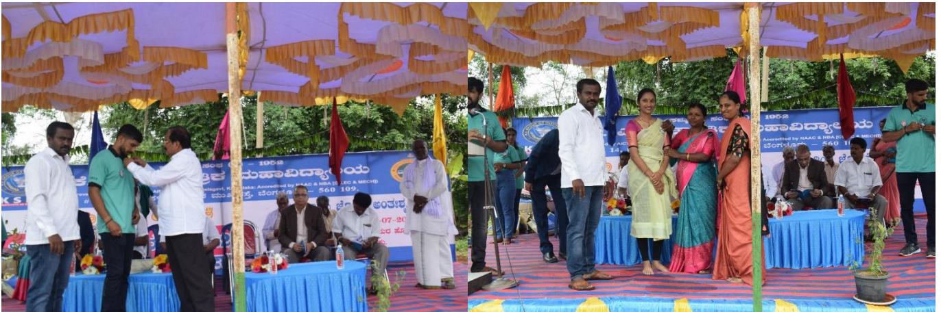
Badge distribution for the Captains of the camp