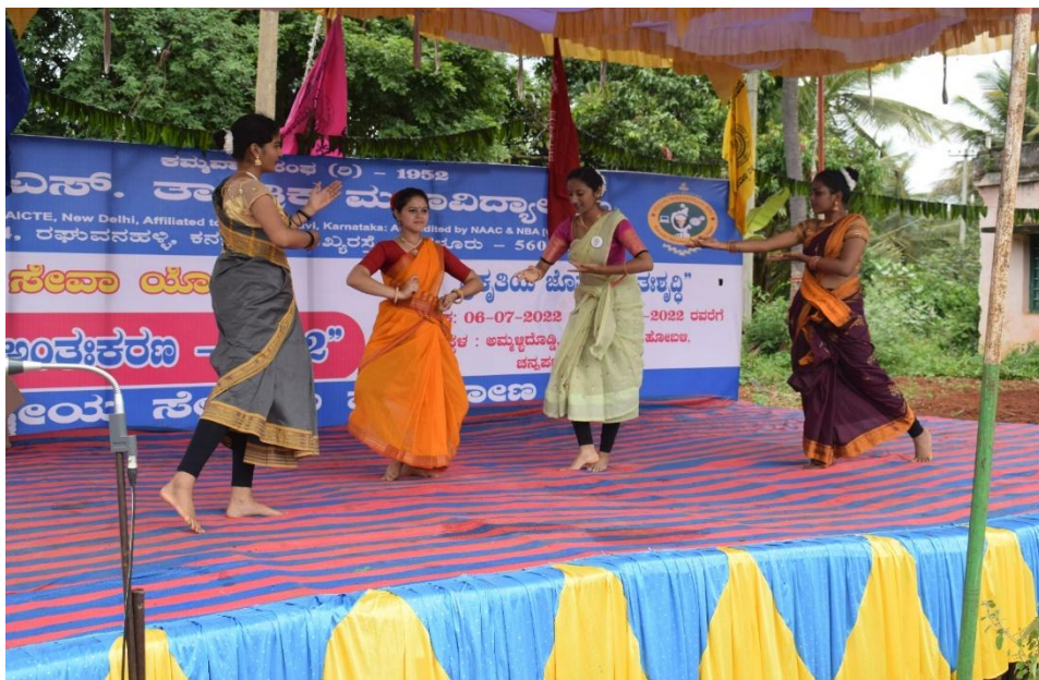
Cultural performance by NSS volunteers