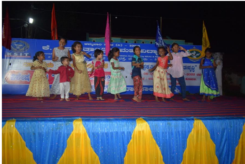
Dance performance by village students