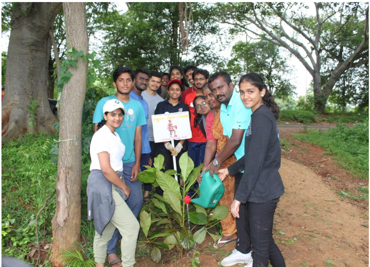
Team SangolliRayanna planting the sampling