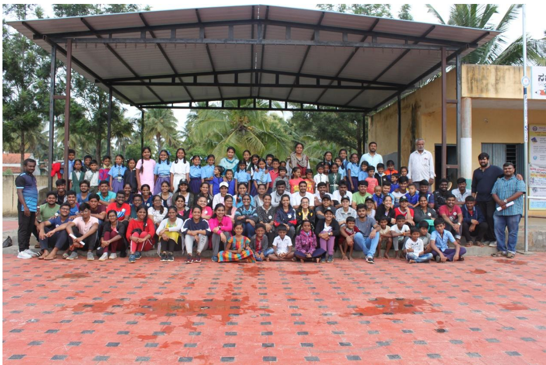
Group photo with School students