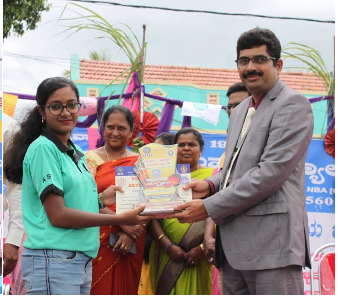
Prize distribution to volunteers