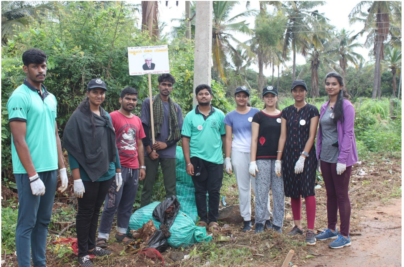
Group photo of team Vishveshwarih