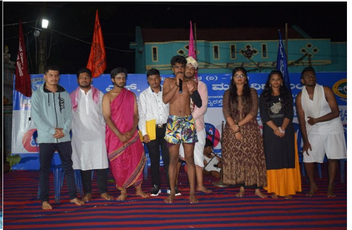
Cultural performances by NSS volunteers