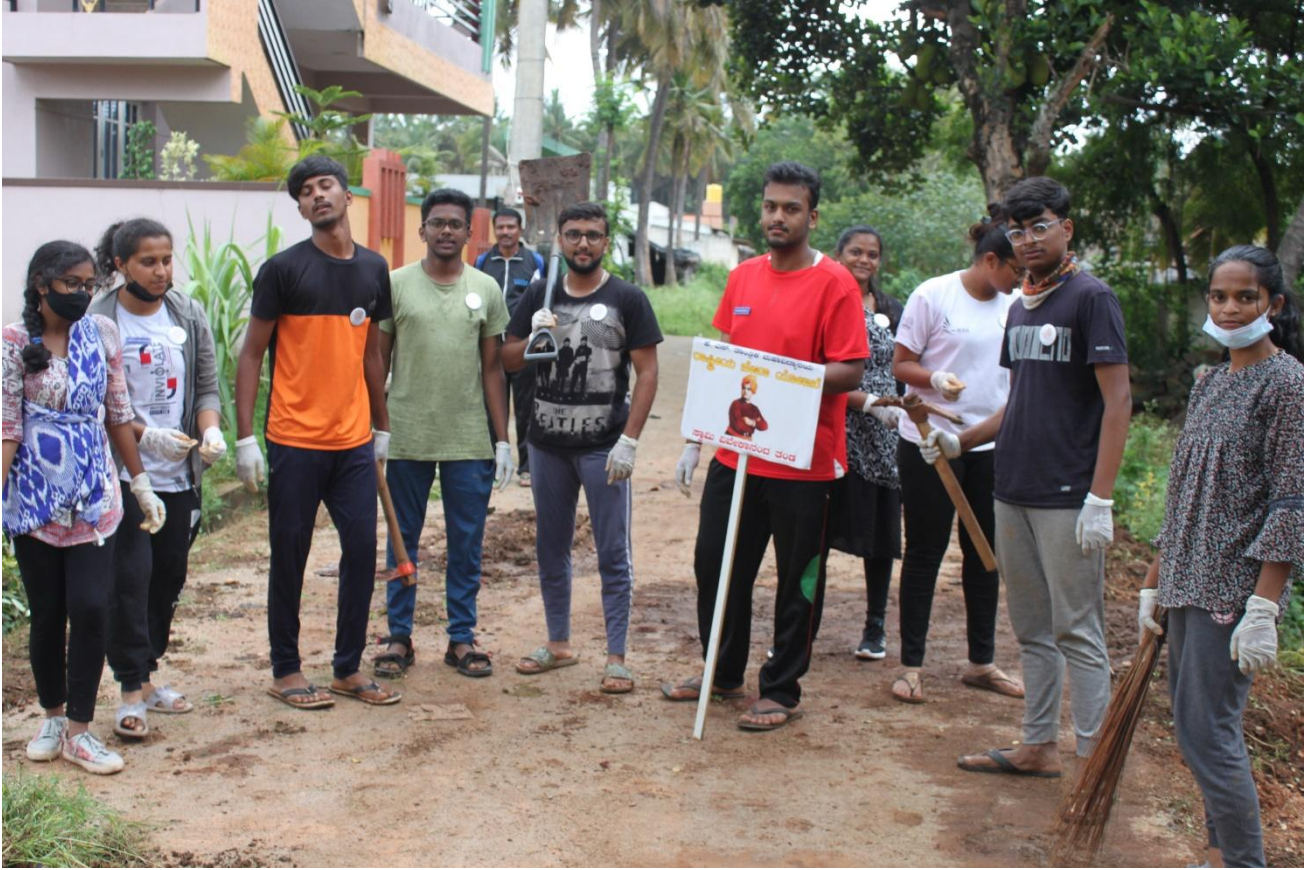
Group photo of team Swami Vivekananda