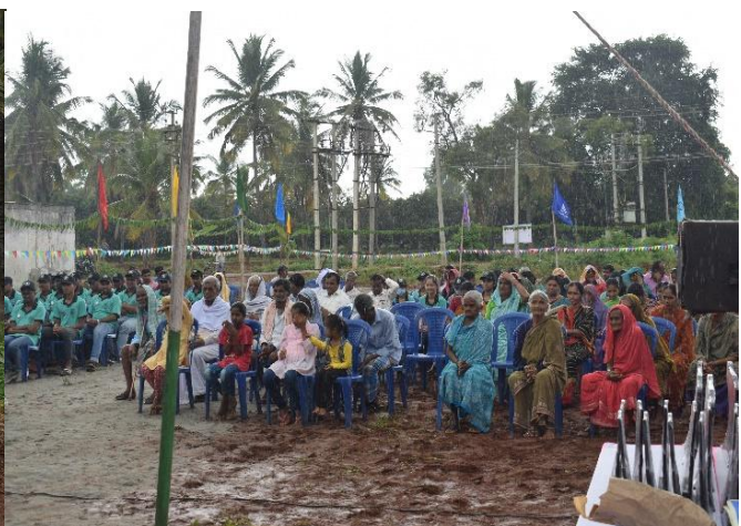
Audience of the Inaugural function