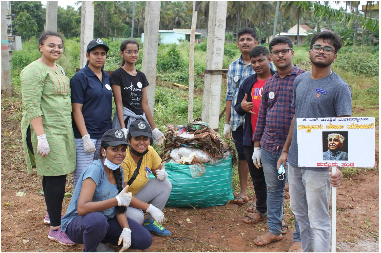
Group photo of team Kuvempu