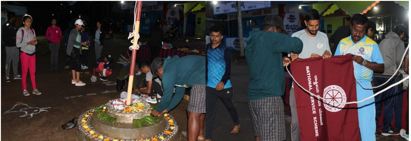
Making arrangements for flag hoisting