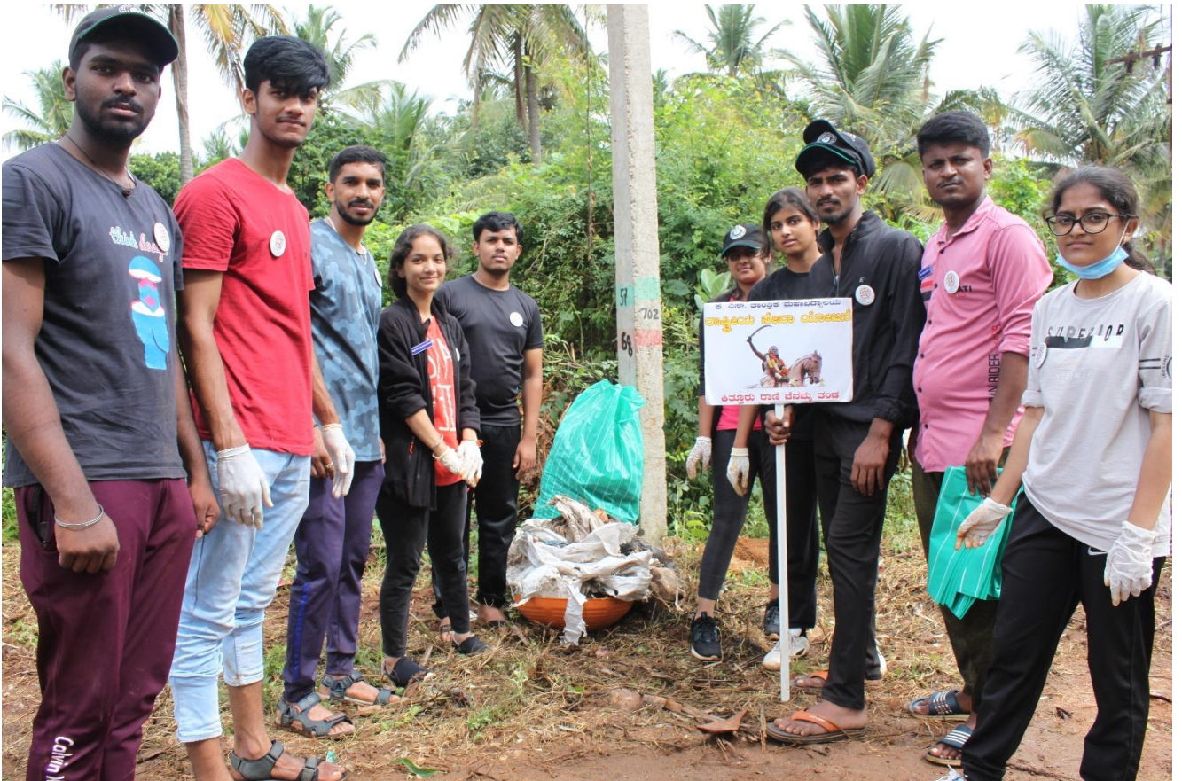
Group photo of team Kitturu Rani Chennamma