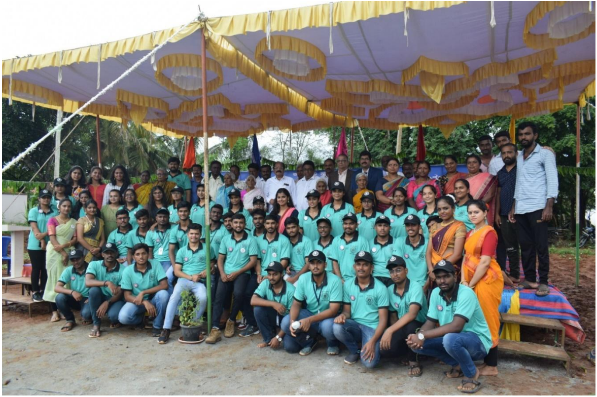
Group photo of NSS volunteers along with the Guests