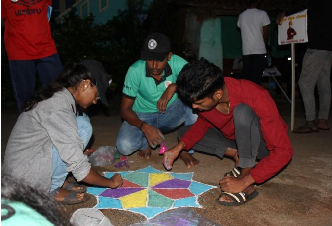
Preparations for flag hoisting