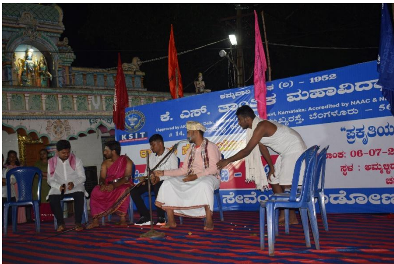
Cultural program by NSS volunteers