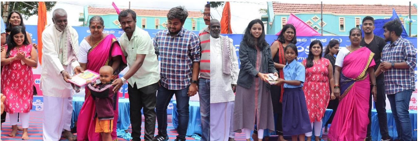
Distributing books and slates to school students