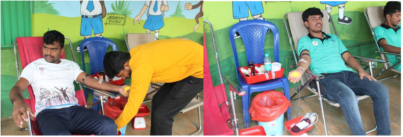
Photos of Blood donation Camp