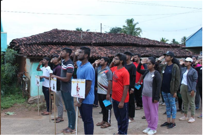
Volunteers assembled during flag hoisting