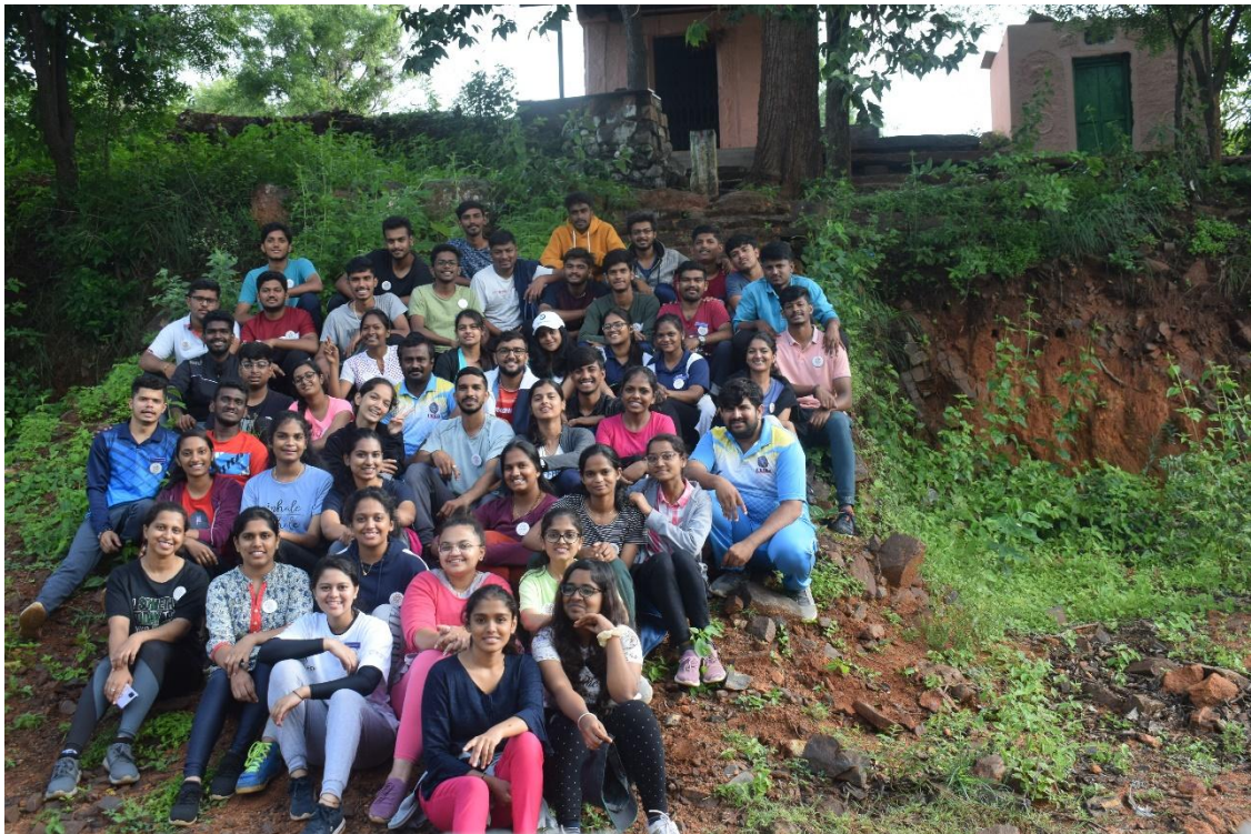
Group photo during trekking