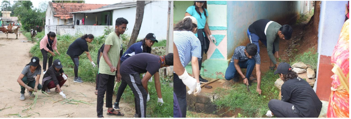
Volunteers cleaning the streets