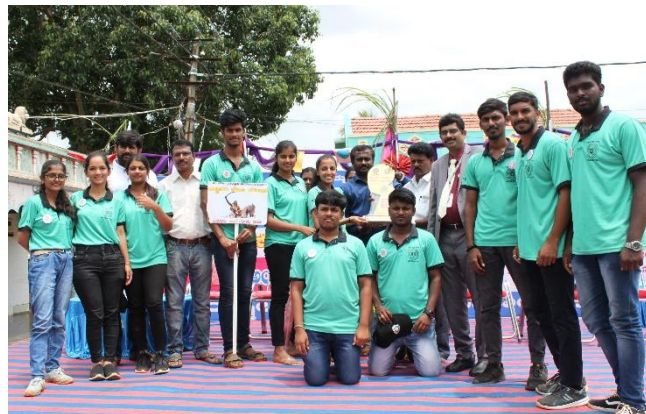
Prize distribution to all the teams