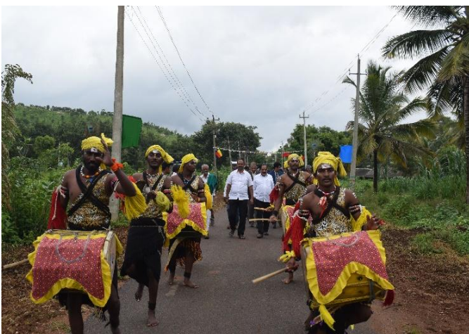
Guests entering the Inaugural function

The program ended by 8:30pm with a message that "There should be schools and toilets developed in villages that horizontally improves the nation". We had our dinner and the day was winded.