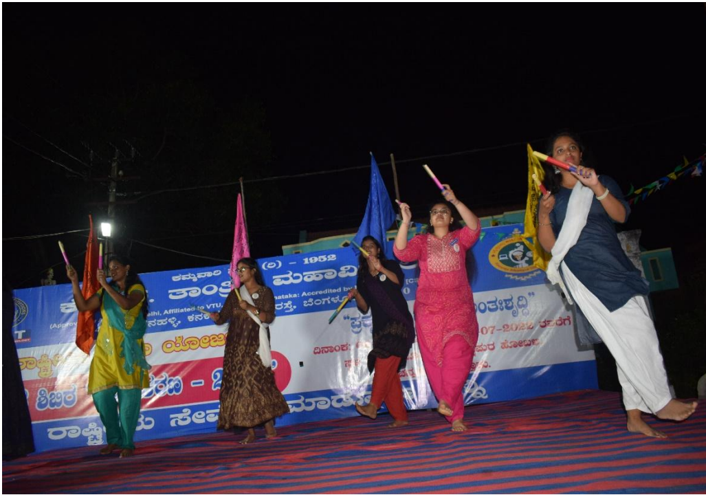
Cultural Performances by NSS volunteers