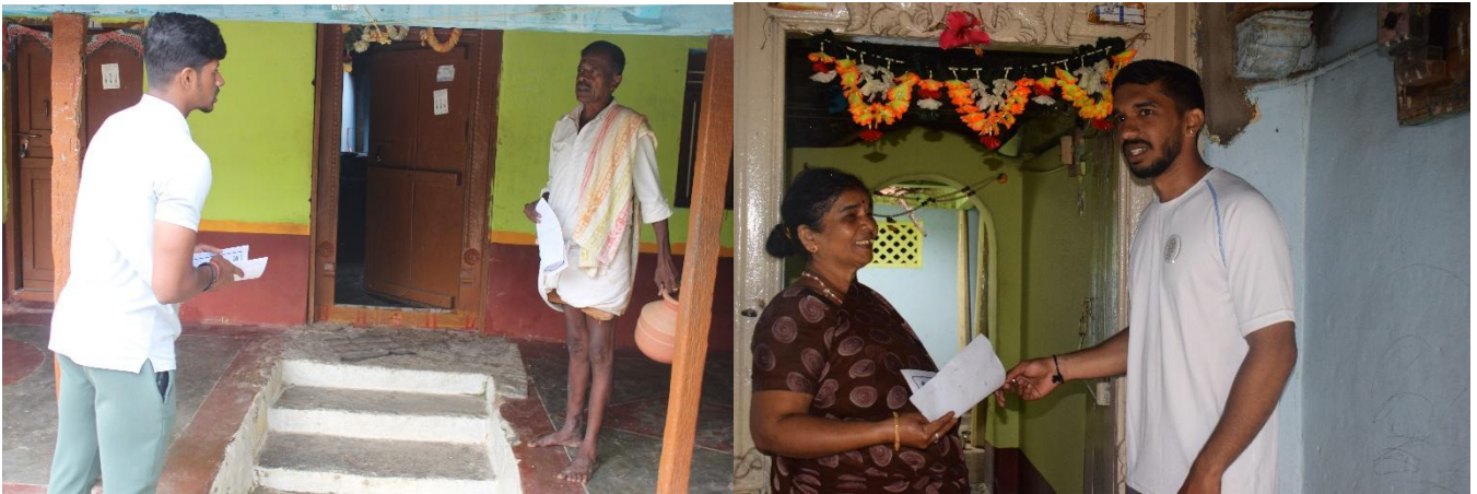
Distributing pamphlets of health check-up