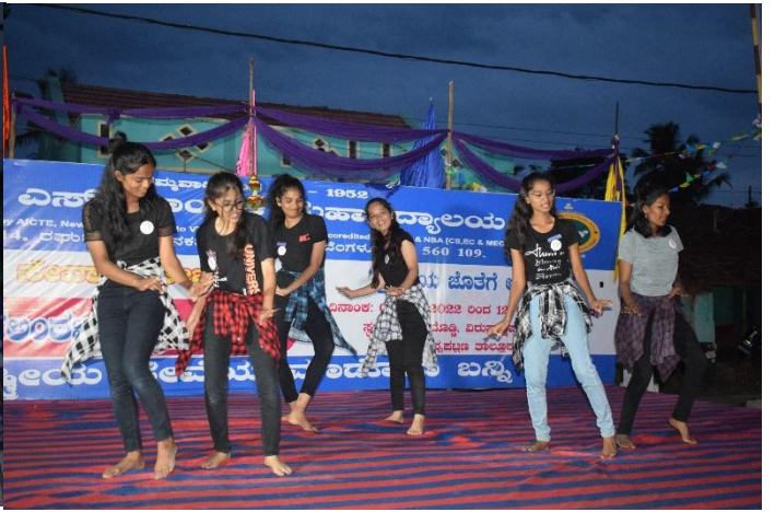
Cultural program by NSS volunteers