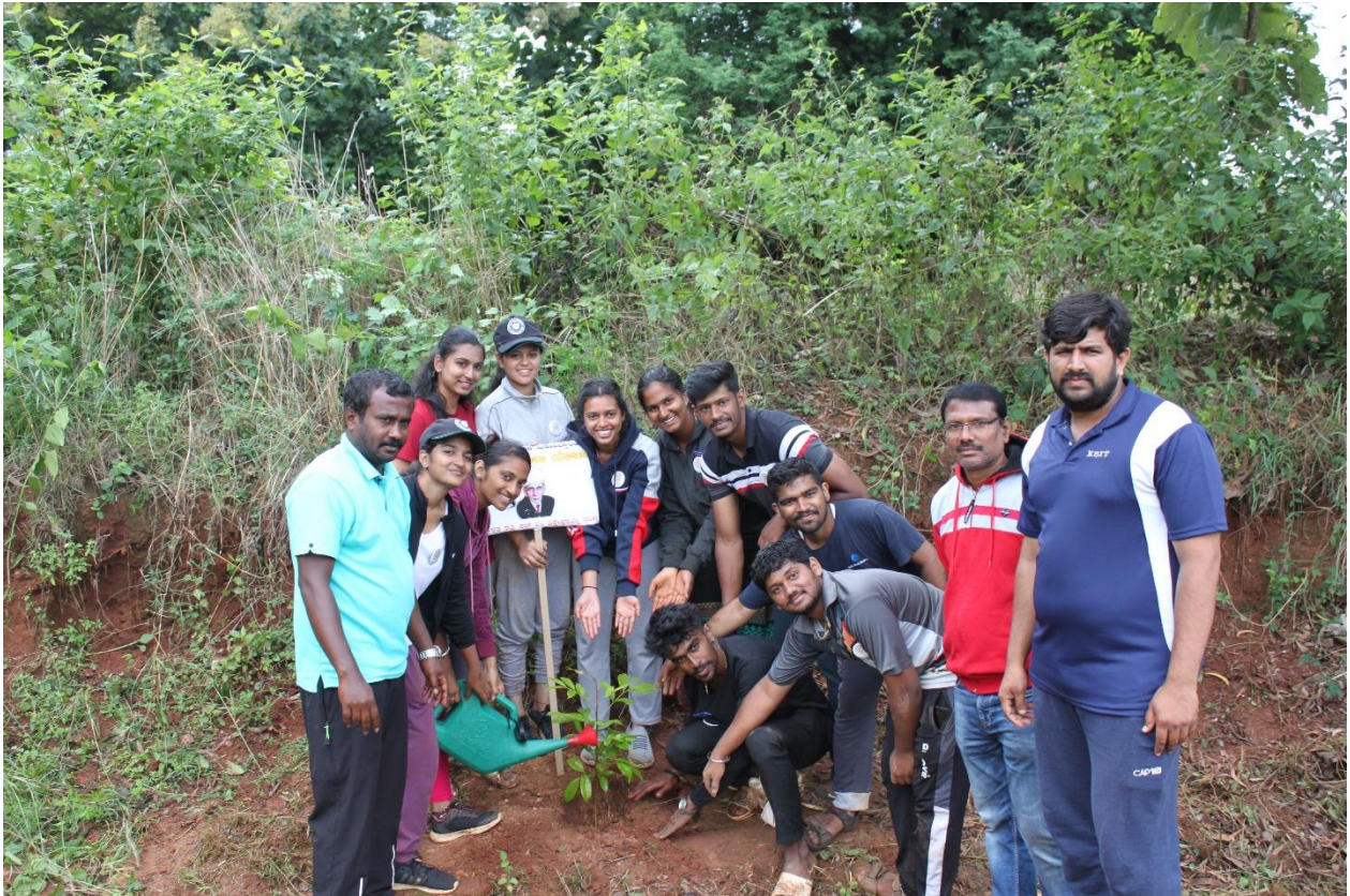
Team Vishveshwaraiah planting the sapling