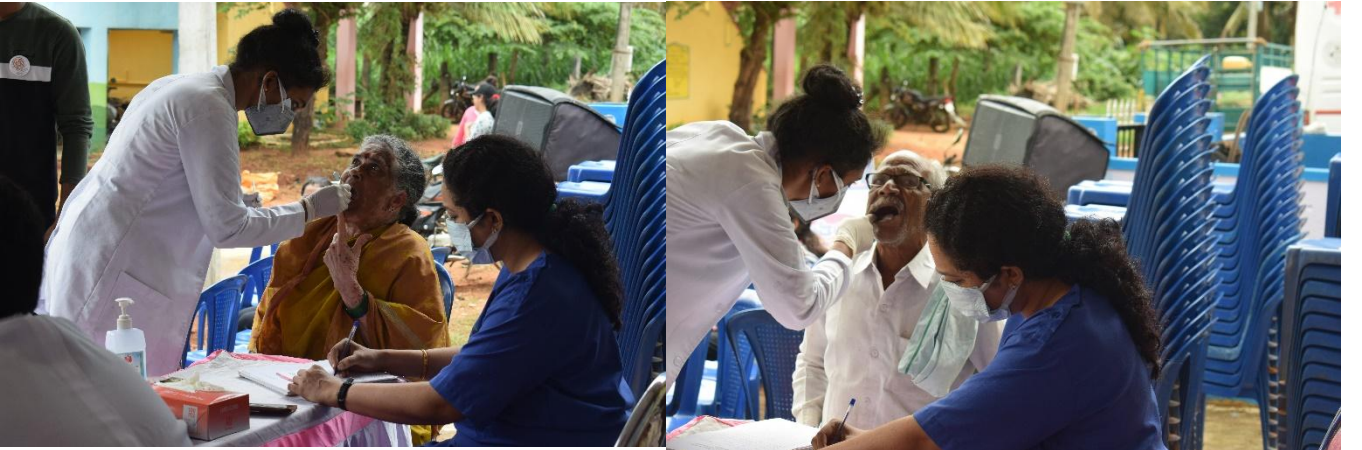
Photos of Dental Camp