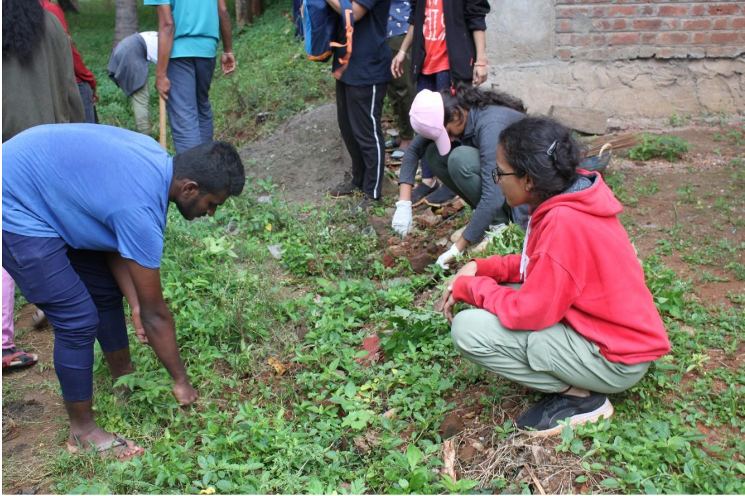
Volunteers cleaning near Samudhaya Bhavana