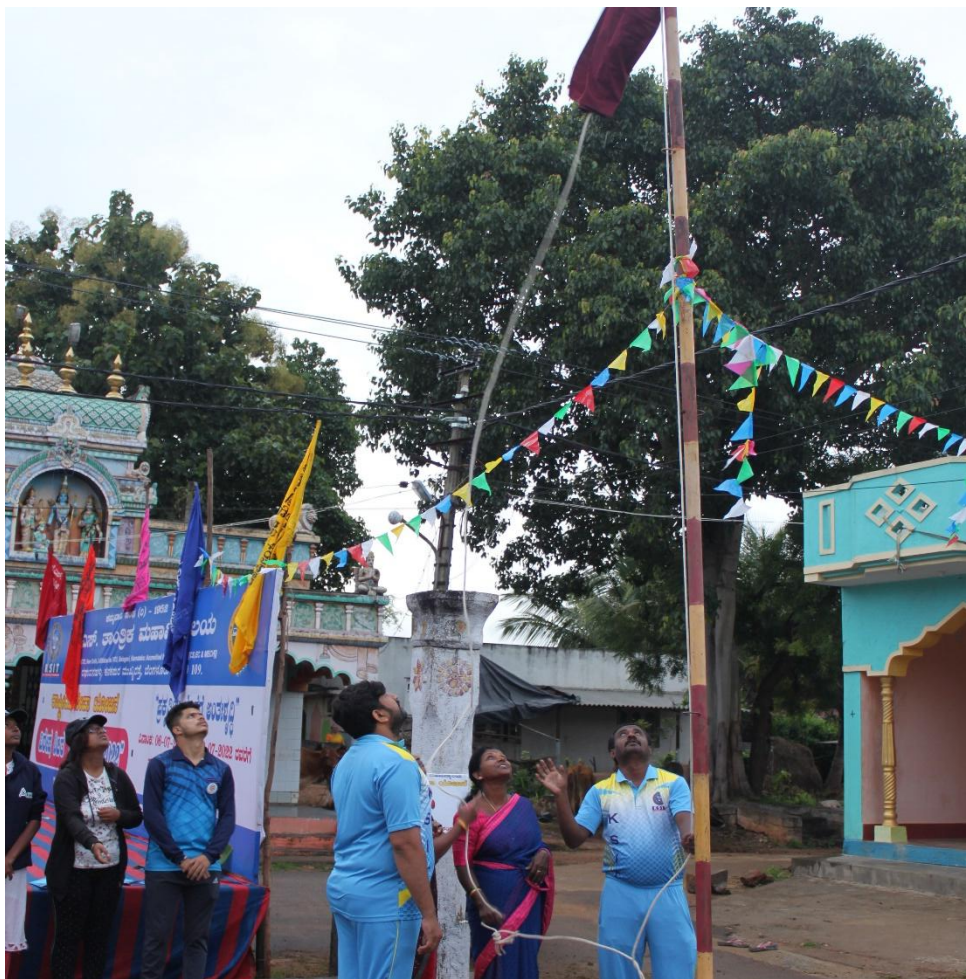
Flag hoisting by the Chief Guests