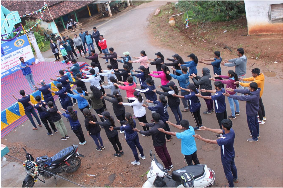
Personality development program