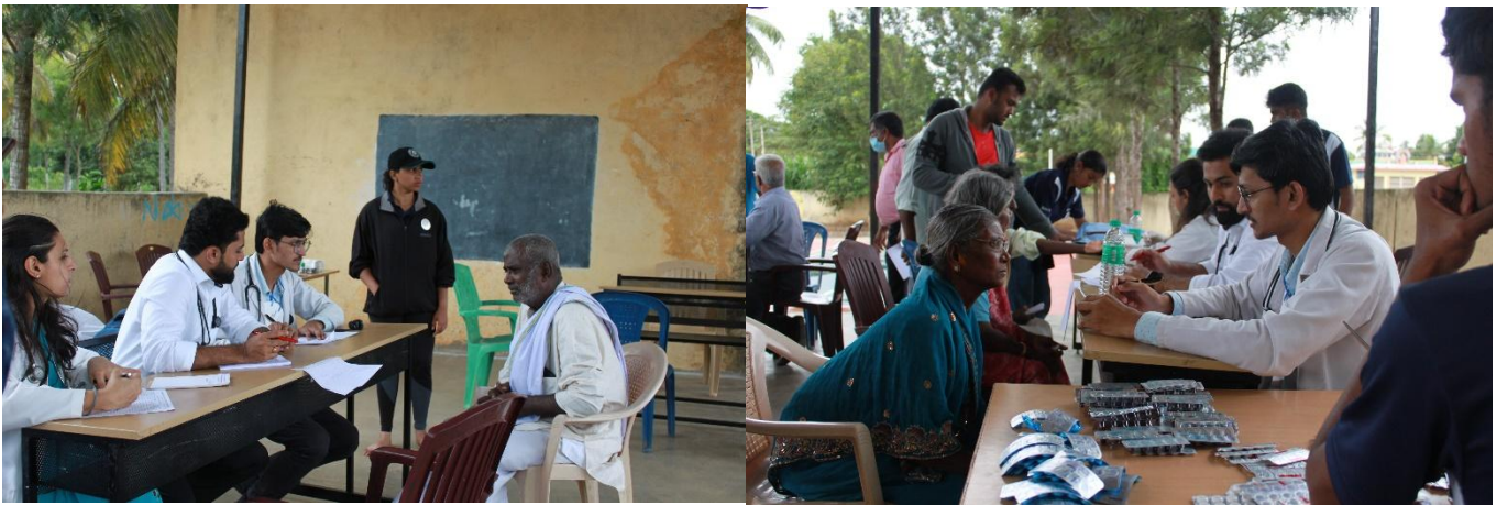
Health check-up for villagers