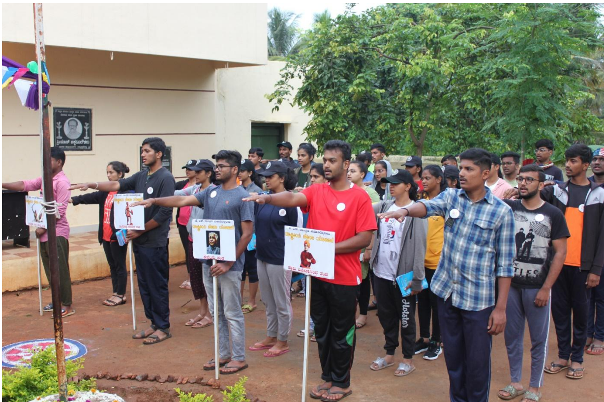
Volunteers taking pledge during flag hoisting