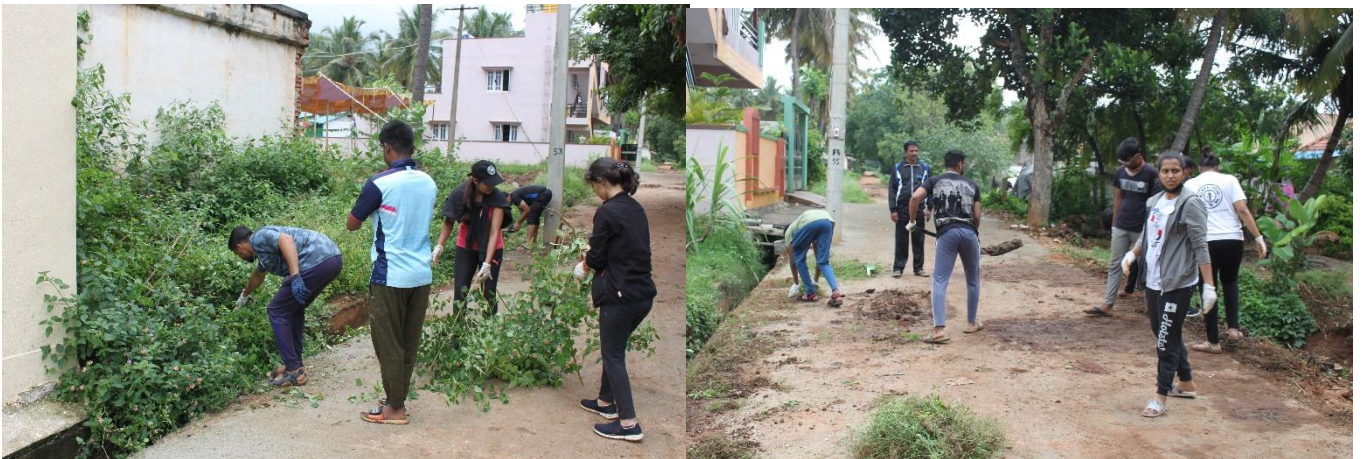
Volunteers cleaning the village streets and drains