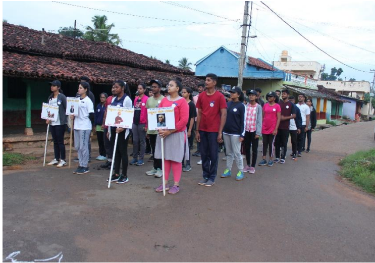
Volunteers assembled for flag hoisting