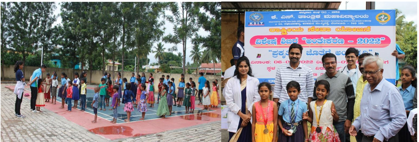
Interaction with school students and prize distribution