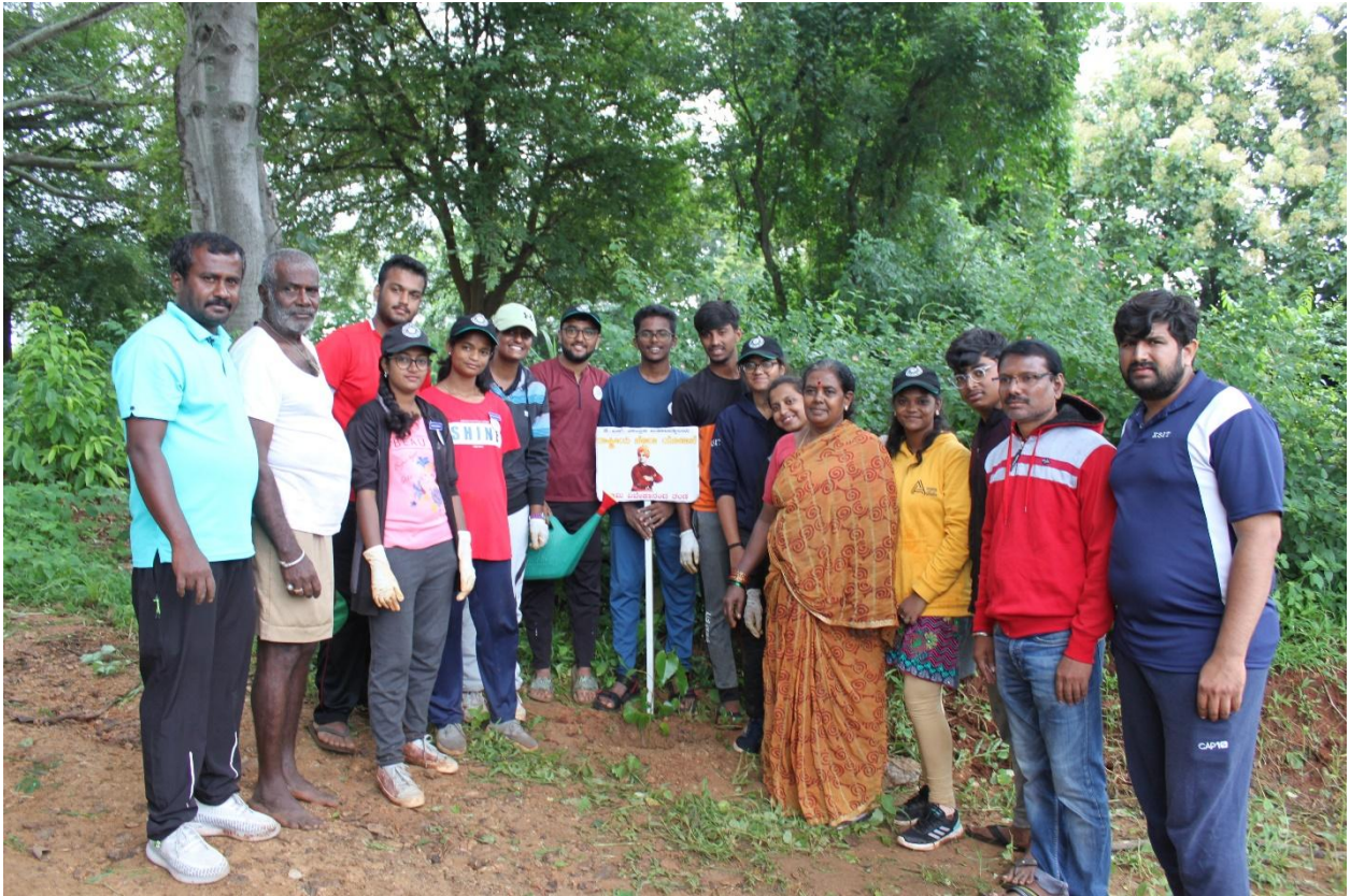
Team Swami Vivekananda planting the sampling