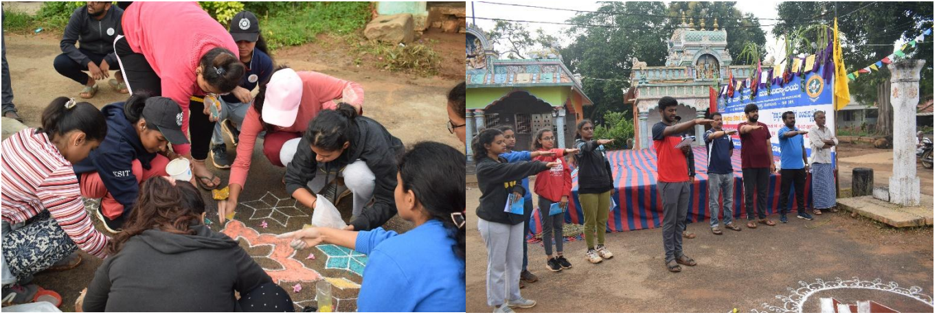
Arrangements for flag hoisting Taking pledge during flag hoisting