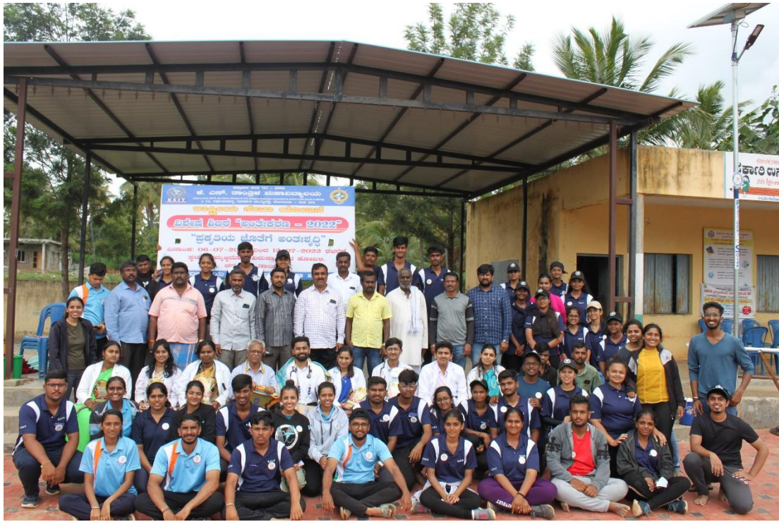
Group photo with doctors