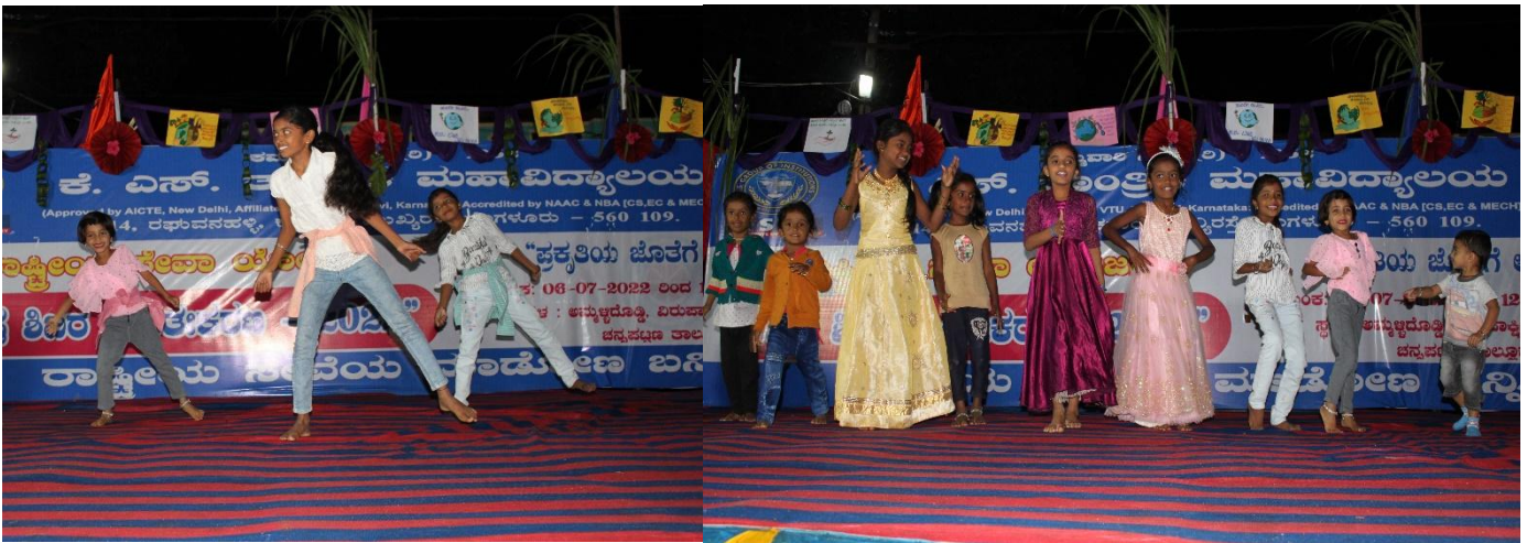
Dance performance by village students