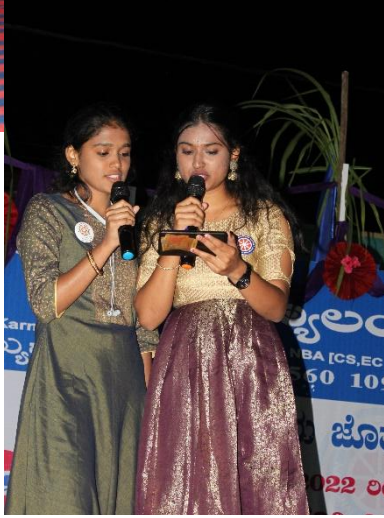
Cultural Performances by NSS Volunteers