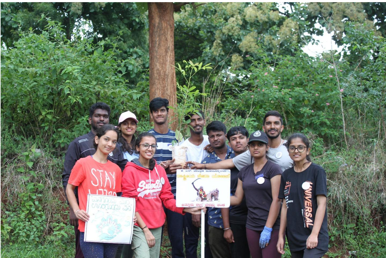
Team Kitturu Rani Chennamma planting the sapling