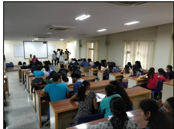
Participants figuring out the answers