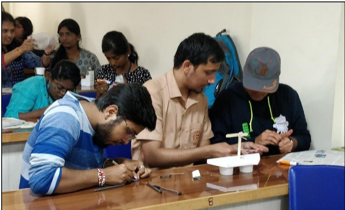
Teams building their products