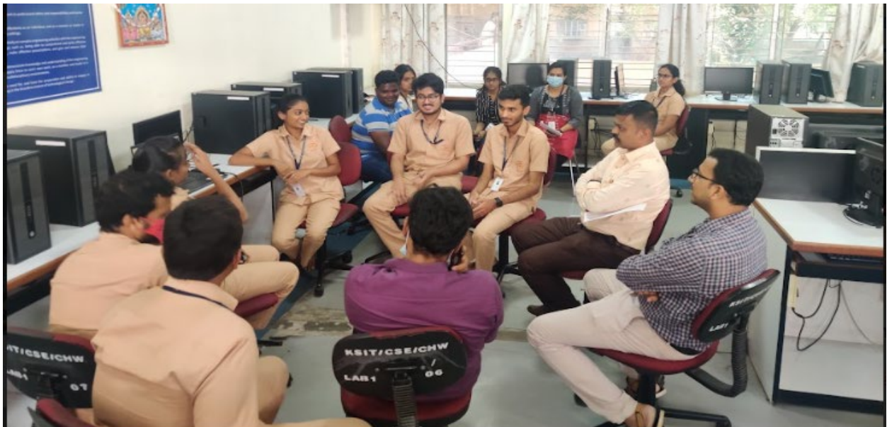
Mentoring for the Teams