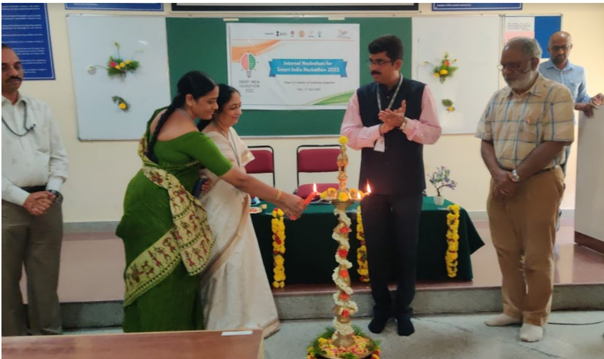
Inauguration of Internal Smart India Hackathon-2022