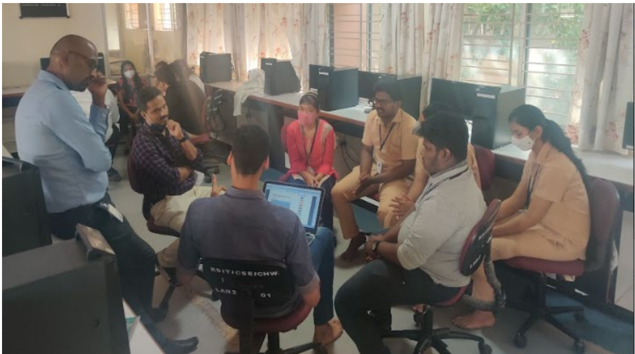
Judging by the Jury