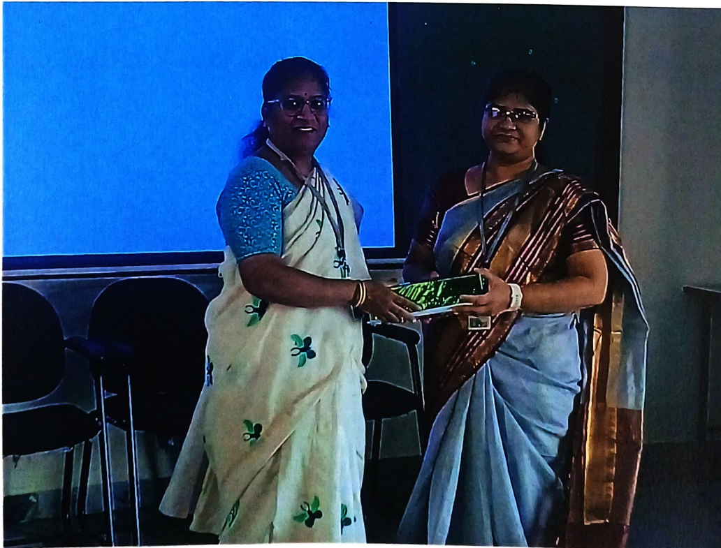
Fig 3: Appreciation of expert by HoD