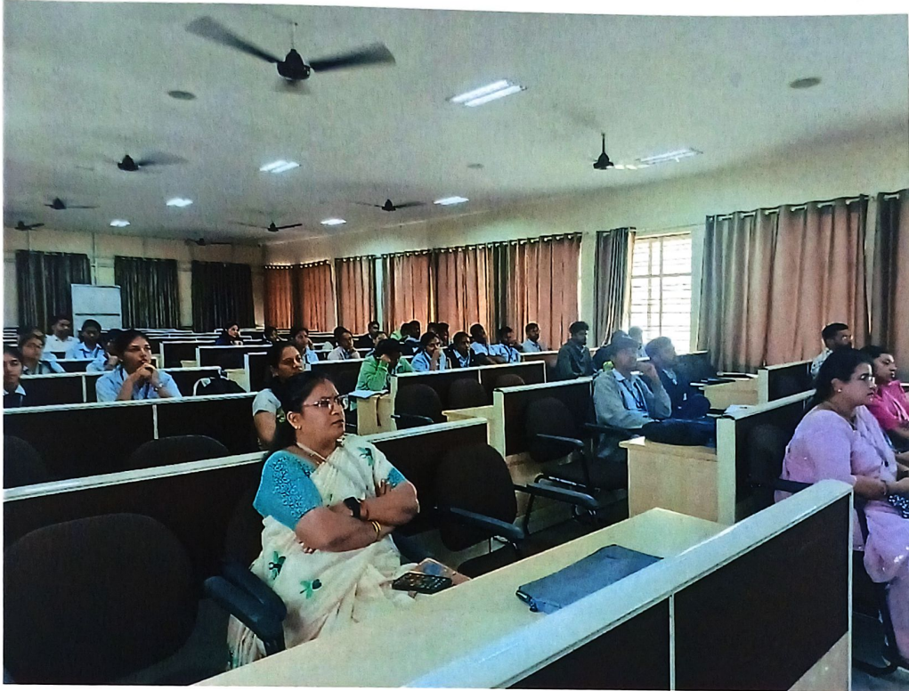
Fig 2: Audience participation in the event