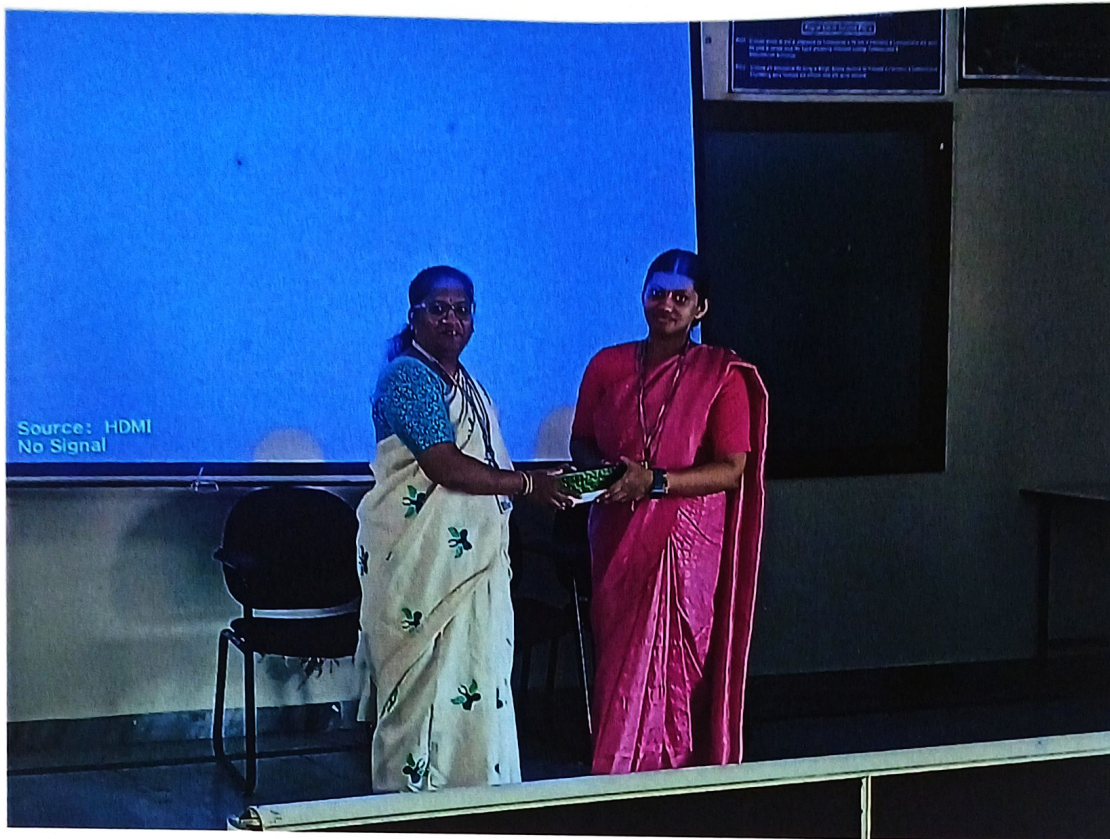
Fig 4: Appreciation of expert by HoD