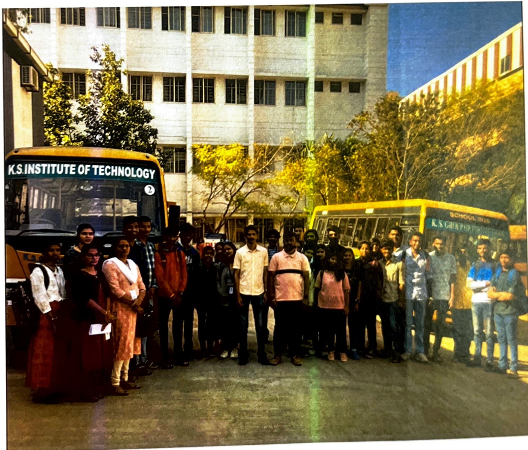
Glimpse during departure from KSIT to IISc-Open Day

The main objective of the Industrial Visit is to give an exposure to the students. This visit will give the students to carry out projects in CSE domain or interdisciplinary. Students participating in events at IISc will boost their technical skills which help them during projects, placements, higher studies.