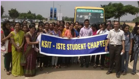
Students of third semester during industrial visit