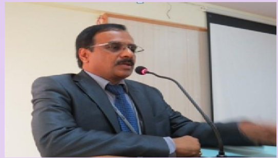
Principal addressing Alumni's and Staff member