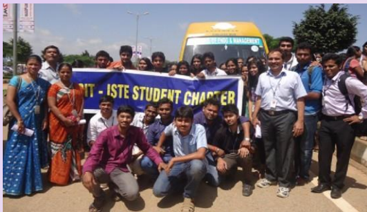
Students of fifth semester during industrial visit