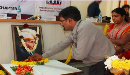
(Various dignitaries lighting the lamp and showering flower petals to photo of Sir. M. Vishveshwaraya).