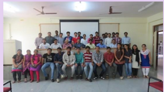
Principal and Alumni Members