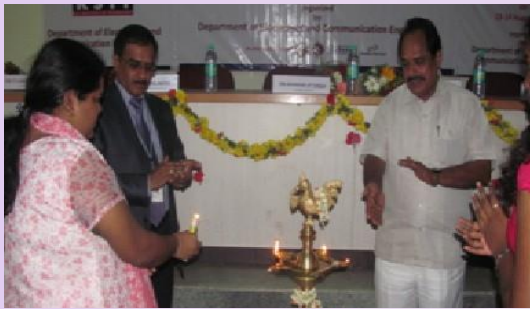
Dignitaries along with the conference delegate lighting the lamp. Thus the conference provided an ample opportunity to interact with internationally acclaimed professionals in various fields.