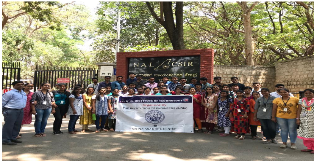
Fig: Industrial visit to NAL for 6 th semester students, ECE Department