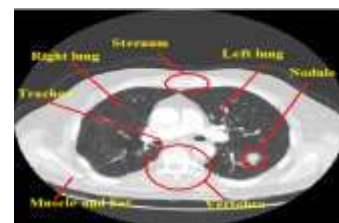
Fig. 1. Lung CT image with different parts and lung nodule.

Among all the imaging modalities LDCT is GOLD STANDARD for detection of lung cancer [17]. As LDCT generates multiple CT images (slices) in one scan, interpretation of such huge number of slices by radiologist to extract the information of existence nodules is challenging task. Thus, now a days cancer detection/diagnosis medical routines uses CADe/x system to get precise information about nodules. CAde system assist the radiologist in detection of nodules and benign or malignant nodules classification is done by CADx system and it thus helps the radiologist in treatment plan. Fig. 1 is CT lung image showing different anatomical structures of lung and red circle shows the presence of lung nodule.