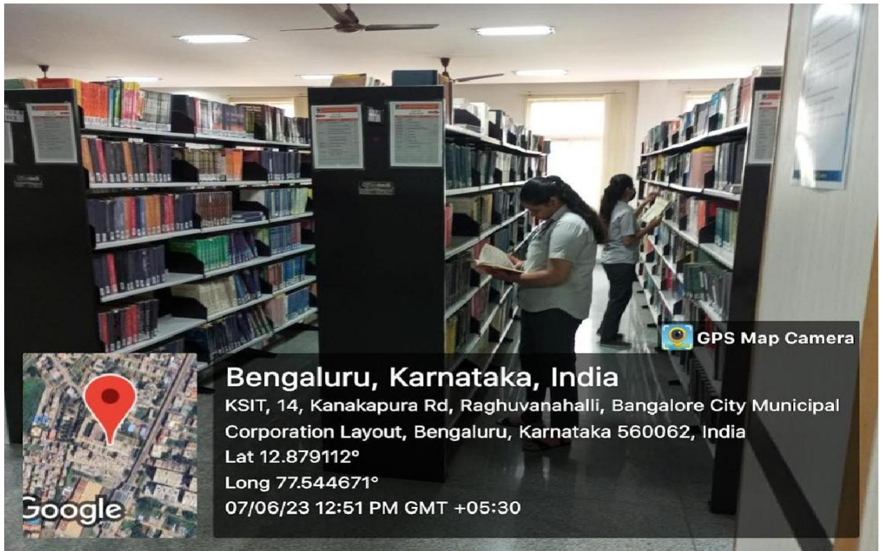
LIBRARY STACK AREA