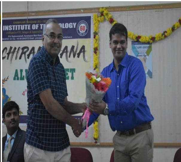
Alumni Association President Welcoming Treasurer