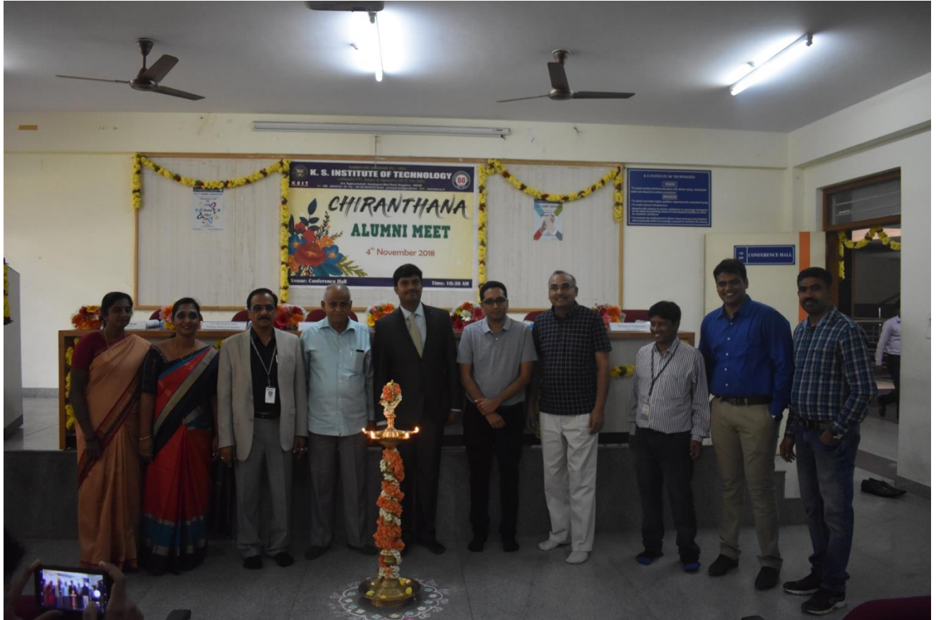
Dignitaries Lighting the Lamp