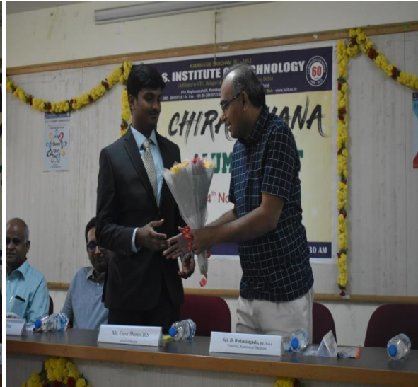
Treasurer Welcoming the Guest of Honor