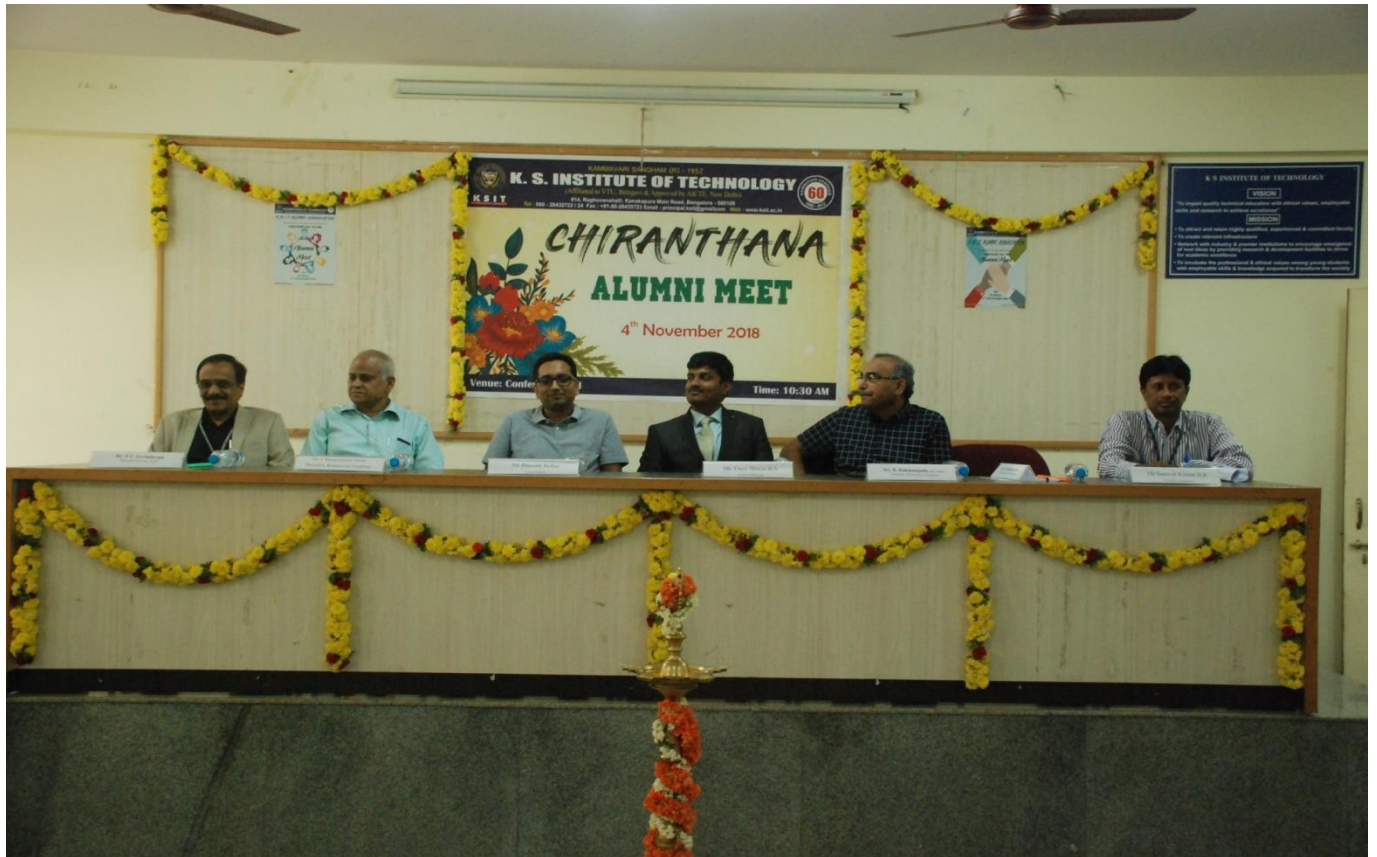
Dignitaries on the Diaz