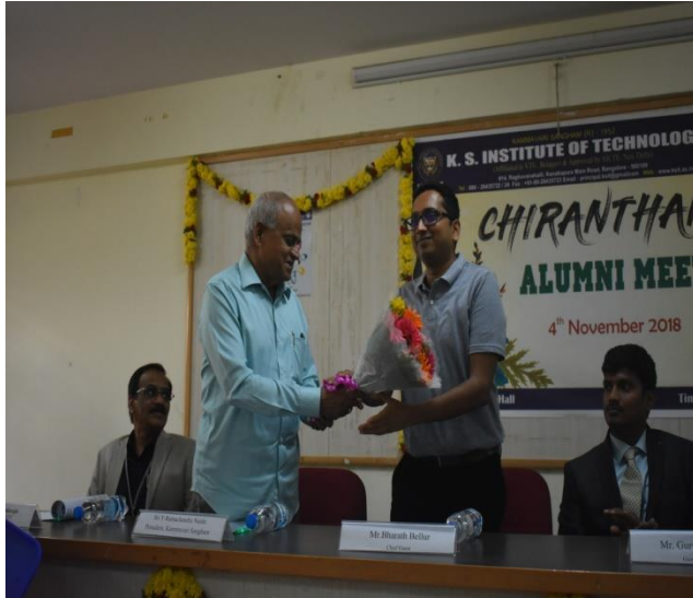
President welcoming the Chief Guest