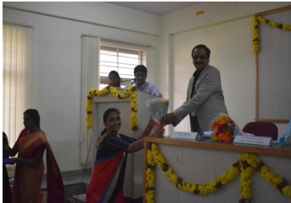
Secretary of the Association welcoming the Principal and Alumni Coordinator