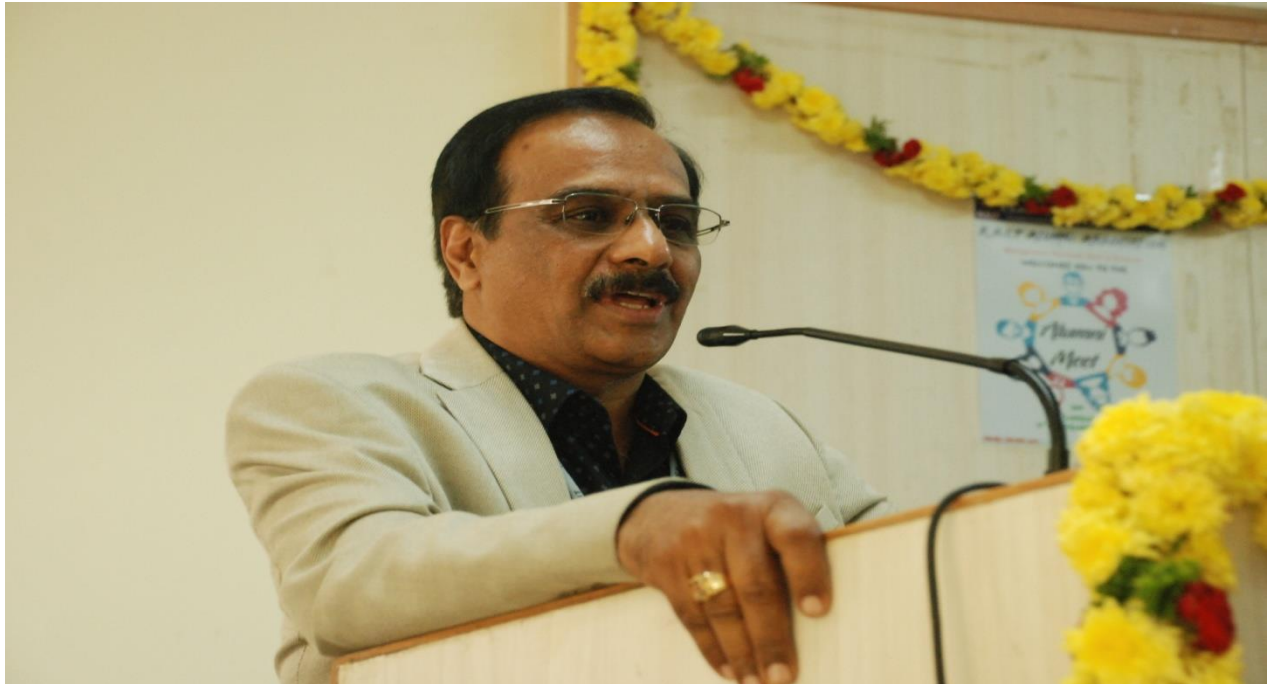
Principal and Rector of the Association addressing the Alumni's