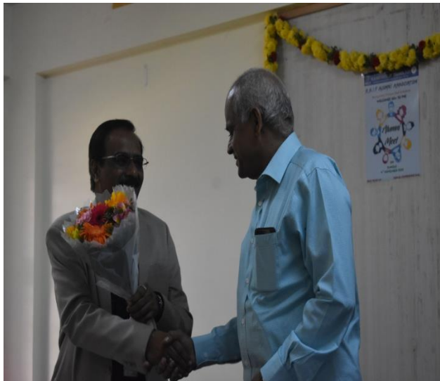
Principal Welcoming President